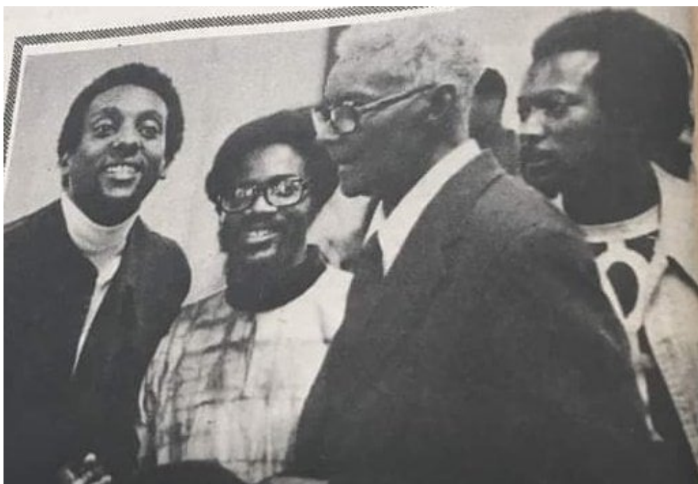
CLR James with Stokely Carmichael and Walter Rodney

Cyril Lionel Robert James was born in 1901 in the Caribbean island-nation of Trinidad and Tobago. During his upbringing he developed a keen interest in literature, political theory and historical studies.