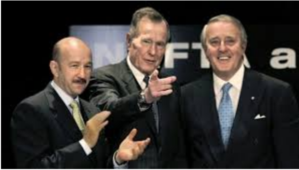
Salinas de Gortari, Bush Senior, Mulroney

At the level of national politics the main issues was US intervention in Latin America affairs, including the funding of opposition groups in Venezuela, the economic blockade against Cuba, and the attempt by the US government to orchestrate a free trade agreement, first between the US and both Canada and Mexico, and then a continent-wide agreement (FTAA, or ALCA in its Spanish acronym). The US regime was successful in the first instance, but failed miserably in the second—having encountered powerful forces of resistance in the popular sector of many states, as well as widespread opposition within the political class and elements of the ruling class and the governing regime in countries such as Brazil.