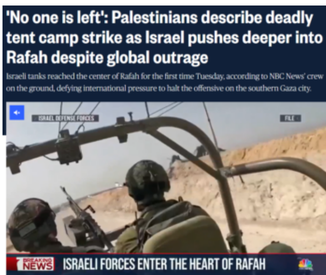
Image: By being embedded with Israeli forces, NBC ( 5/28/24 ) presented news literally from the IDF point of view.

The same sentence continued that Israel was “defying international pressure to halt an offensive that has sent nearly 1 million people fleeing Rafah.” But Israel was not just “defying...pressure”; it was in violation of a direct order from the International Court of Justice ICJ to halt its attack on Rafah. Yet NBC reporters rode into Rafah with an army that was ignoring international law to commit further genocide in Gaza.