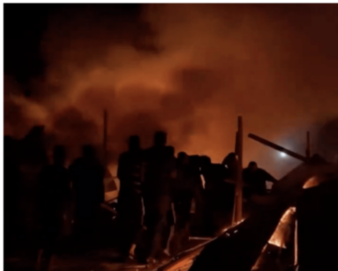
Image: CounterPunch ( 5/31/24 ): “When the Israeli bombs strafed the safe zone, the plastic tents caught fire, sending flames leaping two meters high, before the melting, blazing structures collapsed on the people inside, many of them children who’d just been tucked in for the evening.”

The world saw the terror of the massacre on international and social media. Images showed the area of the strike engulfed in flames as Palestinians screamed, cried, ran for safety and sought to help the injured. “They told people to move there then killed them,” Richard Medhurst ( 5/28/24 ) posted.