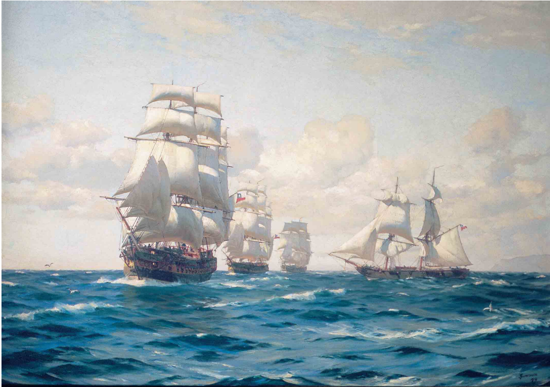
The First Chilean Navy Squadron engaged in the liberation of Peru and sailed as far as to Baja California raiding Spanish ships.

All these economic events promoted a social-living change in society primarily having a direct impact on the speedy process of urbanization followed by the emergence of new social groups whose everyday life strictly depended on contemporary technology (concerning production) and trade (in essence in global terms). That was, in fact, a Latin American (urban) middle class that emerged not belonging either to landlords or peasants.