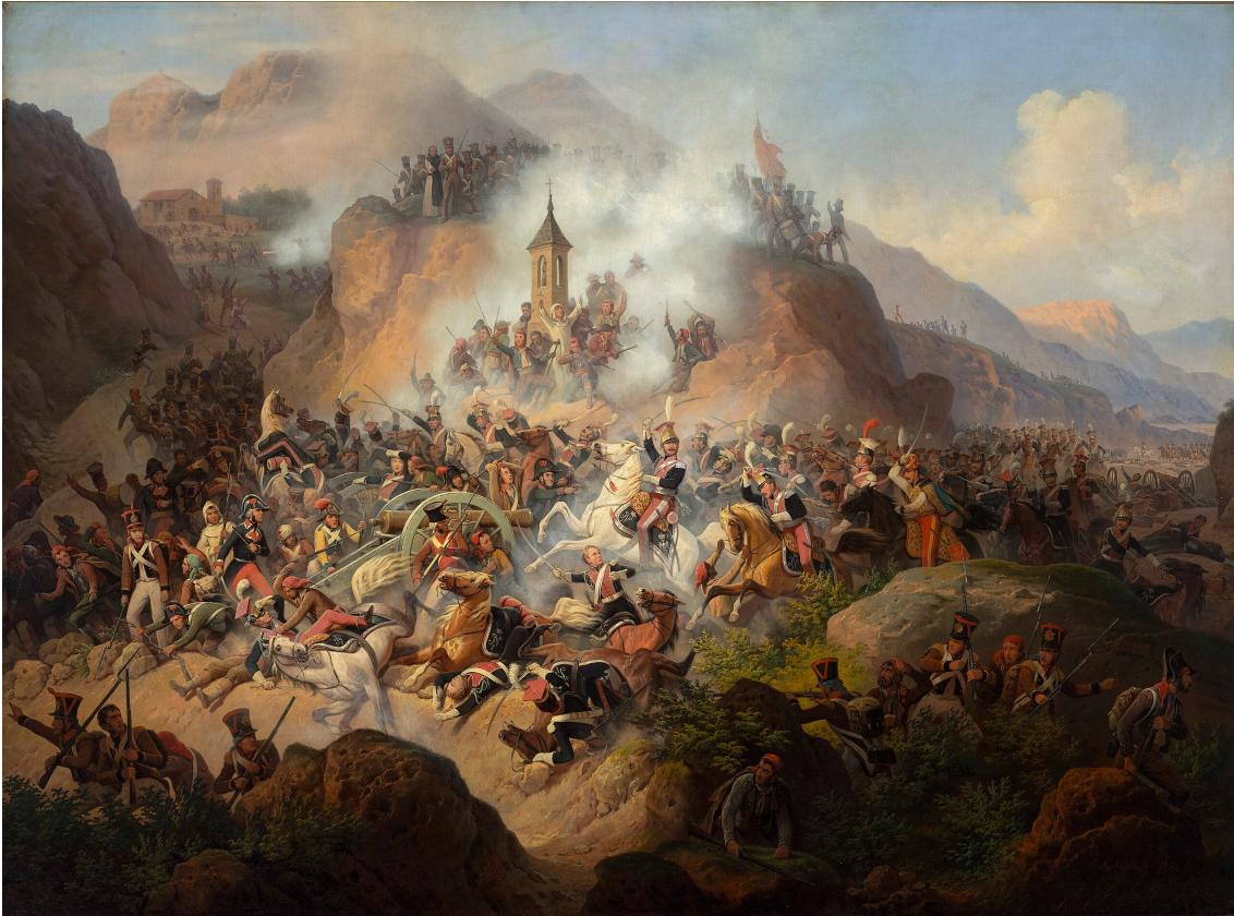
Spanish regular and irregular forces fighting in the Somosierra Pass against a French invading army

Economically speaking, in the 19 th century emerged a new power social-economic basement – hacienda , the great land estate (much bigger than a ranch ) that was utilizing much more land compared to invested capital surviving by a cheap labor of both natures: servile and seasonal. On one hand, slavery, and the slave trade were soon abolished in all newly proclaimed independent states of Spanish Latin America (by the 1850s).