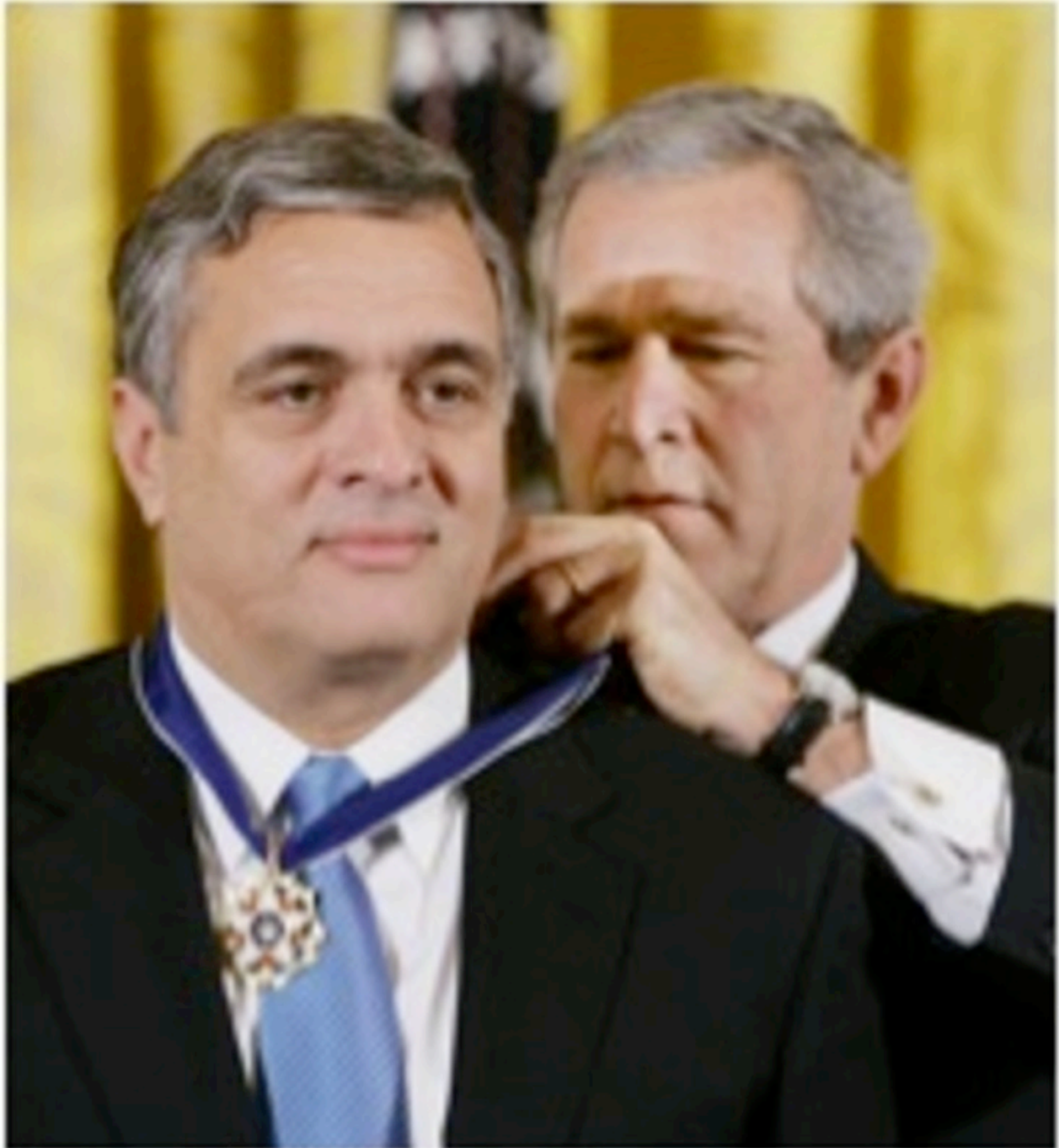
President Bush awarding National Medal of Honor to George Tenet, Dec. 14, 200