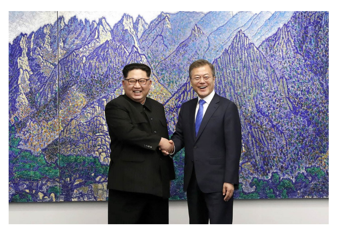
North Korean Leader Kim Jong-un and Moon shake hands inside the Peace House.

National Information Service (NIS) went to Washington to communicate Pyongyang's intention. This was the opening of the series of summits which gave the world the hope of peace on the Korean peninsula.