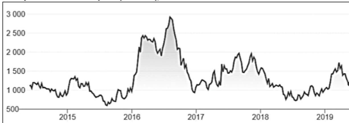
Sibanye-Stillwater share price (SA cents), 2014-19

As a result, complained a Deutsche Securities analyst just before the Lonmin takeover, "We currently cannot see meaningful free cash flow from any of Sibanye's divisions until 2020, which coupled with a significant debt load of R22 billion ($1.6 billion), leaves us holders of the share on a valuation basis."