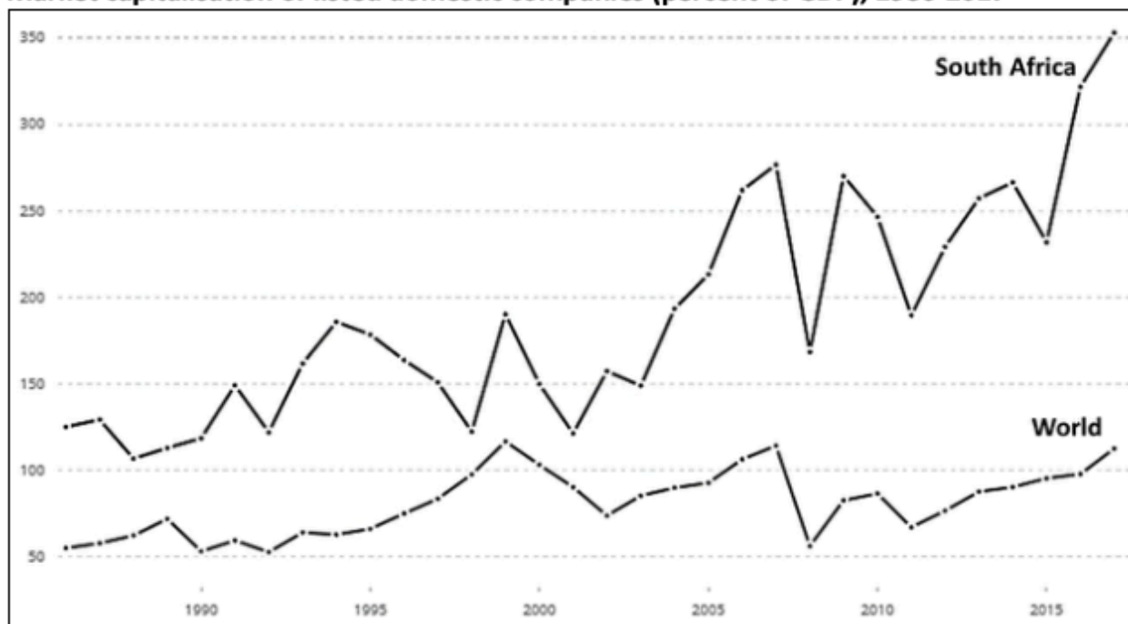
Market capitalisation of listed domestic companies (percent of GDP), 1986-2017