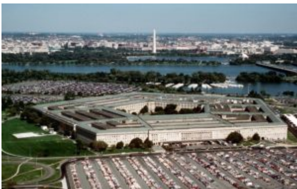
The Pentagon, headquarters of the U.S. Defense Department, as viewed with the Potomac River and Washington, D.C., in the background.

DB: One of the important points you make in the book is that, whatever any analyst has to say about who is likely to prevail, nuclear war means mutual destruction.