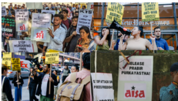
Image: Protests in New Delhi and New York City decrying the raid and detention of journalists in India.

Media should be close to the realities and needs of the country, and should be in tune with the basic precepts and values enshrined in our constitution – equality, secularism, special concern for the weaker sections, national integration and unity, peace and goodwill. Freedom of media is very important and this is also a basic constitutional precept, but it should not be misrepresented to justify increasing corporate control to an extent that media is alienated from genuine concerns of the people and instead promotes narrow interests and viewpoints. Cooperative efforts of journalists should be encouraged. Along with freedom, socially responsible behavior of new social media is important and new technologies should not be misused.