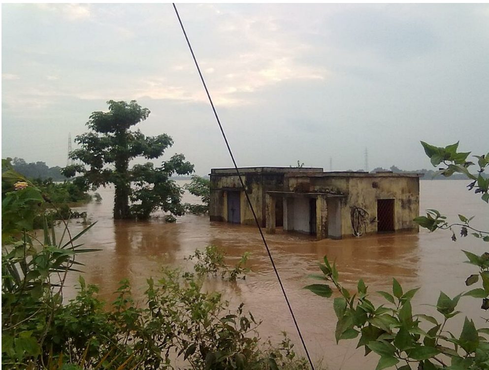
Flooding in Odisha (Licensed under Creative Commons)

Increasing harm from several natural disasters is already a serious concern, while the threat from disasters can increase substantially in times of more aggressive climate change. Therefore according much higher priority to protection from natural disasters has to be a very important part of policy framework now and in the times to come. To be effective this effort has to learn from past experience and be willing to correct serious mistakes made earlier, as is evident from the increasing damage even after vast amounts had been invested in flood protection. So both increasing budgets and correction of distorted policies are important for protection from disasters. Planning for reduction of loss of life in an earthquake, cyclone or tsunami should get very high priority, as also various measures to provide protection from prolonged or acute droughts.