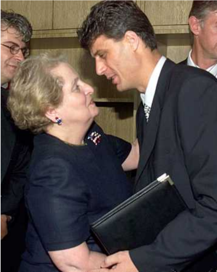
Albright and KLA leader Hashim Thaci

While negotiations were ongoing in Rambouillet, NATO decided to increase the readiness of its assigned forces “so as to make them able to execute the operation within 48 hours”. 46 In other words, “peace negotiations” had been initiated in Rambouillet (contrary to the Vienna Convention) under the threat of impending air strikes. NATO had granted a three weeks period to the parties meeting in Rambouillet to conclude negotiations.