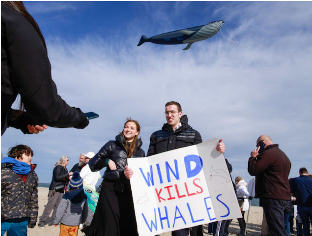
Environmentalists gather during a 'Save the Whales' rally calling for a halt to offshore wind energy development along the Jersey Shore on February 19, 2023 in Point Pleasant New Jersey.

As of June, scientists have documented at least 14 humpback and minke whales washing ashore dead in the two states compared to nine in all of 2022. Between December and May, the National Oceanic and Atmospheric Administration (NOAA) documented 25 dead whales washing ashore along the entirety of the East Coast, nine in New Jersey. The whales washing ashore are dramatic affairs, as they have on several occasions appeared on boardwalk beaches frequented by families, alarming locals.