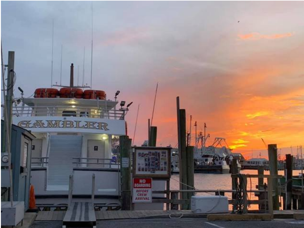
The Gambler fishing boat, Point Pleasant Beach, New Jersey.