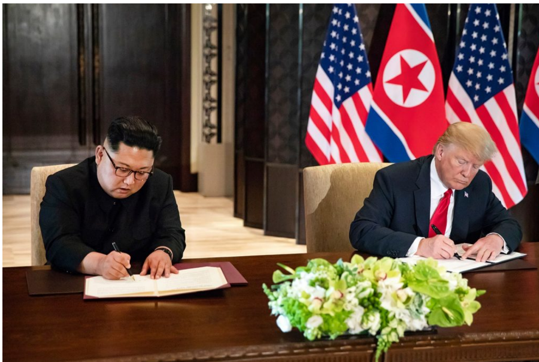
President Donald J. Trump and North Korean leader Kim Jong Un sign a joint statement | June 12, 2018

It seems that it is almost impossible for Trump to keep his promise, unless he is free from the “Washington Trap”.