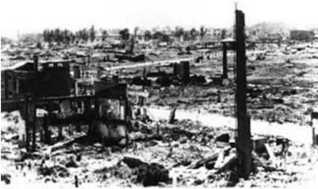
Pyongyang capital of North Korea, in 1953, almost entirely destroyed by U.S. bombing during the Korean War.