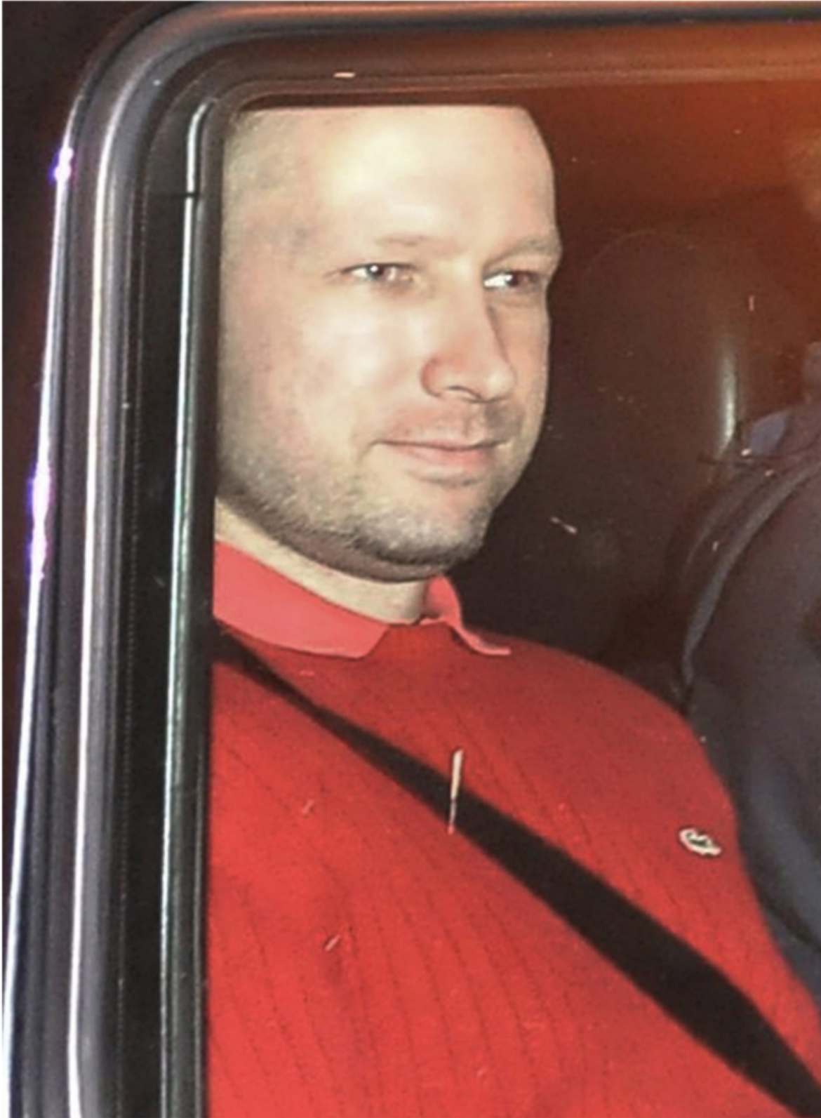
Breivik under arrest

There is no evidence that Unabomber's actions, or the two assassination attempts against President Gerald Ford (by Lynette Fromm and Sara Jane Moore) were deep events in this second, more limited sense. The still not understood nerve gas attacks of 1995 in the Tokyo subway, by the Buddhist group Aum Shinrikyo, can be seen as a possible deep event. 2 The attack on Pope John Paul II is a more probable one, because of the murderer's membership in the Turkish Grey Wolves, an activist movement close to the Turkish security apparatus