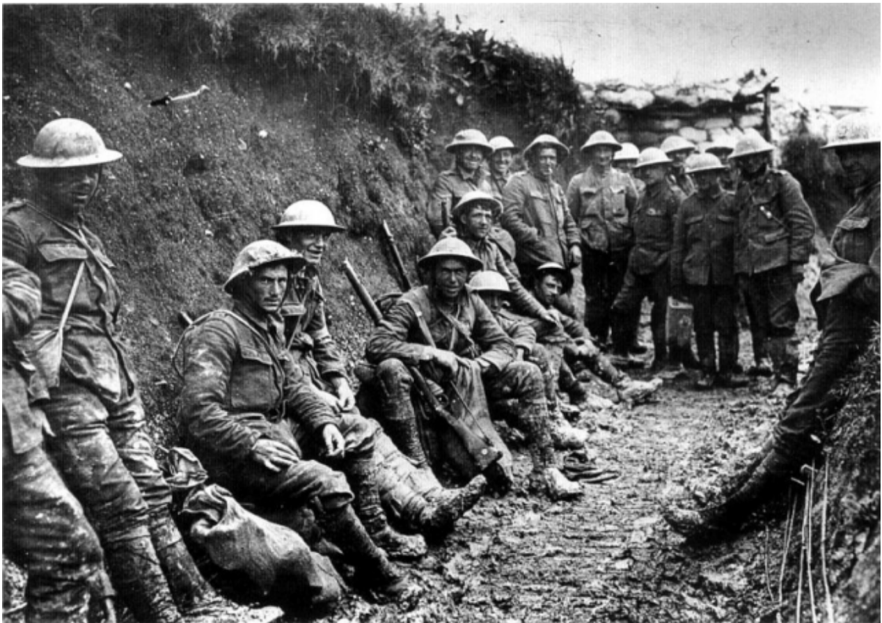
Exhausted soldiers after a battle in World War I