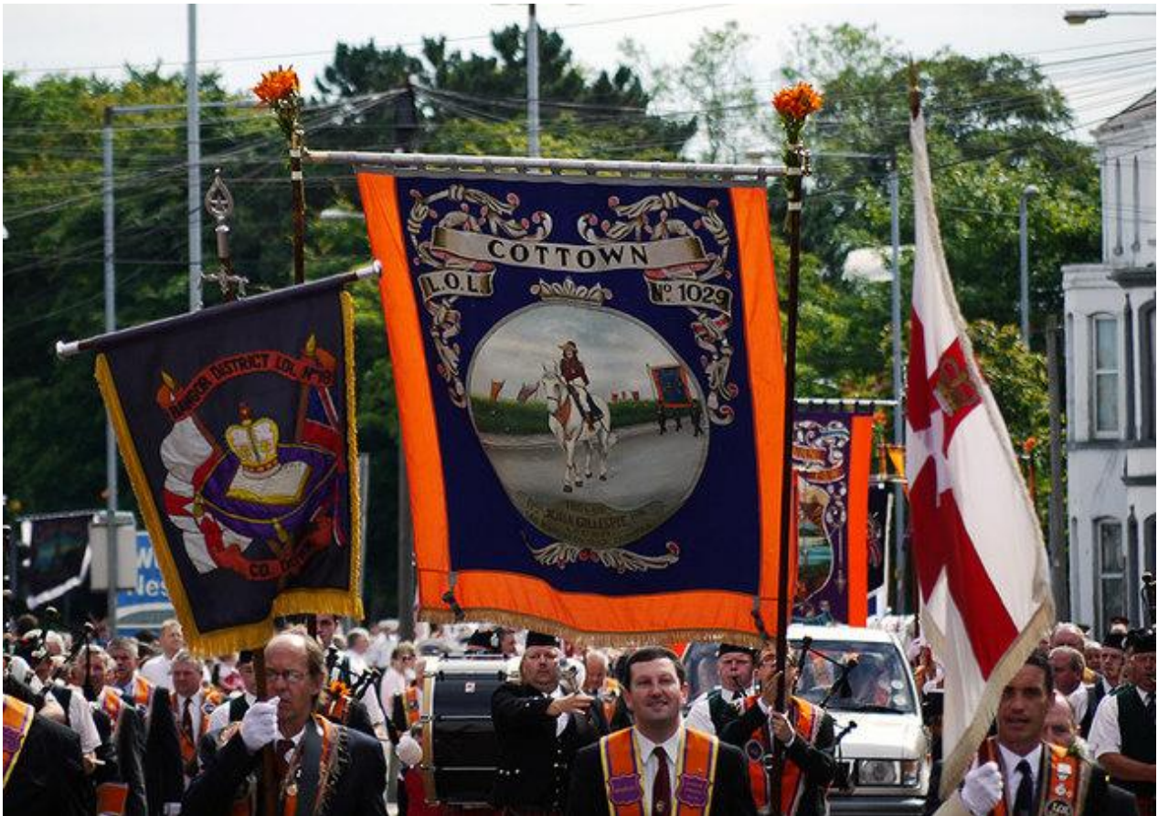
Orangemen marching in Bangor on the Twelfth of July 2010

In the pre-partitioned Ireland of the 19th century many Protestants were nationalists. For example, Thomas Davis, the Irish nationalist, was well known for a doctrine of nationality that he propagated through the newspaper, The Nation , of which he was one of the founders. He described his tenets as “a nationality that would embrace all creeds, races and classes within the island [...] which would establish internal union and external independence”. As a Protestant of mixed English and Anglo-Irish parentage, his nationalist views and writings put him into conflict with the colonial strategies of the empire. By proclaiming the slogan “gan teanga, gan tír” (no language, no nation) he tried to redress some of the worst effects of colonial policies.