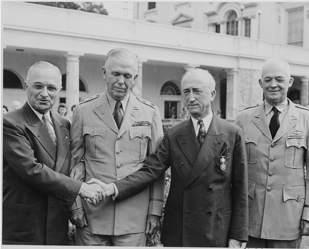
Photograph of President Truman shaking hands with Secretary of State James F. Byrnes after awarding him the Distinguished Service Medal, as General George C. Marshall and General Henry "Hap" Arnold look on.

But the United States, the only power already guilty of nuclear manslaughter, continues to perfect its nuclear arsenal and to proclaim its "right" to launch a "first strike" whenever it chooses.