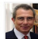
Ernesto Zedillo Director, Yale Center for the Study of Globalization, Yale University; Former President of Mexico