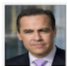
Mark J. Carney Governor and Chairman, Bank of Canada; Board of Directors, Bank for International Settlements