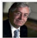
Mervyn King Governor, Bank of England; Former Professor, London School of Economics; Fellow, The British Academy