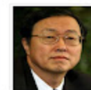
Zhou Xiaochuan Governor, People's Bank of China; Former President, Chinese Construction Bank; Former Asst. Minister of Trade