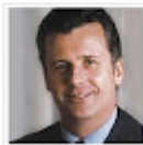
Philipp Hildebrand Chairman of the Governing Board, Swiss National Bank; Former Partner, Moore Capital Management