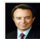
Guillermo Ortiz Martínez Former Governor, Banco de México; Chairman of the Board, Bank for International Settlements