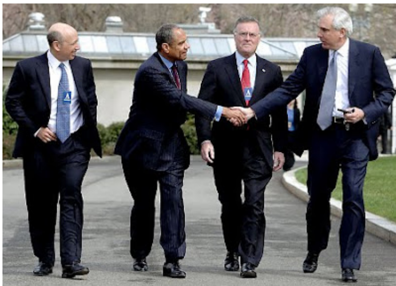
Photo: (left to right) Lloyd Blankfein of Goldman Sachs, Kenneth Chenault of American Express, Kenneth Lewis of Bank of America and Edward Yingling of the American Bankers Association. These are some of the people who really run America, everyone else is for public relations, deflecting public ire, and placating the masses.