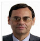
Jaime Caruana General Manager, Bank for International Settlements; Former Governor, Banco de España