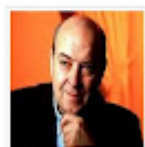
Domingo Cavallo Chairman and CEO, OFC Asociados, LLC; Former Minister of Economy, Argentina