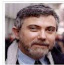
Paul Krugman Professor of Economics, Princeton University; Former Member, Council of Economic Advisors