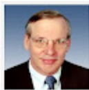
William C. Dudley President, Federal Reserve Bank of New York; Former Partner and Managing Director, Goldman Sachs