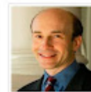
Kenneth Rogoff Professor of Public Policy and Economics, Harvard; Former Chief Economist, International Monetary Fund