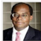
Roger W. Ferguson, Jr. President and CEO, TIAA-CREF; Former Chairman, Swiss Re America Holding Corporation