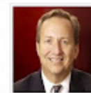
Lawrence Summers Former Director, National Economic Council; Former President, Harvard University; Former US Treasury Secretary