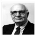
Paul A. Volcker Chairman of the Board of Trustees, Group of Thirty; Former Chairman, Federal Reserve System

The Group of Thirty describes itself as "a private, nonprofit, international body composed of very senior representatives of the private and public sectors and academia," that aims to "deepen understanding of international economic and financial issues, to explore the international repercussions of decisions taken in the public and private sectors, and to examine the choices available to market practitioners and policymakers." A list of the group's members can be found on their website. (Click on the images below to enlarge.)