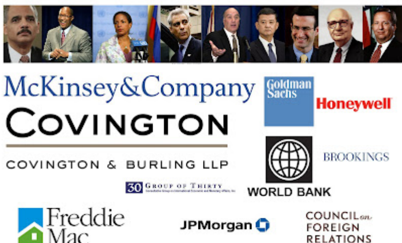
Image: Some members of President Obama's cabinet – each associated with the corporations and institutions pictured below them.

Obama's cabinet represents some of the largest corporations and banks on earth. It is unlikely that if intelligent, but otherwise misled liberals understood that Obama is just as much a corporate-fascist puppet as his predecessors were, they would continue supporting him. Obama's nose-diving approval rating seems to indicate that such a realization is occurring.