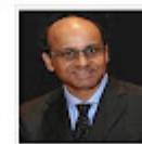
Tharman Shanmugaratnam Finance Minister, Singapore; Former Managing Director, Monetary Authority of Singapore