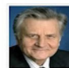
Jean Claude Trichet President, European Central Bank; Former Governor, Banque de France; Former Secretary General, G8