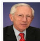
Stanley Fischer Governor, Bank of Israel; Former First Managing Director, International Monetary Fund