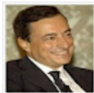
Mario Draghi Governor, Banca d'Italia; Chairman, Financial Stability Board; Former Vice Chairman, Goldman Sachs