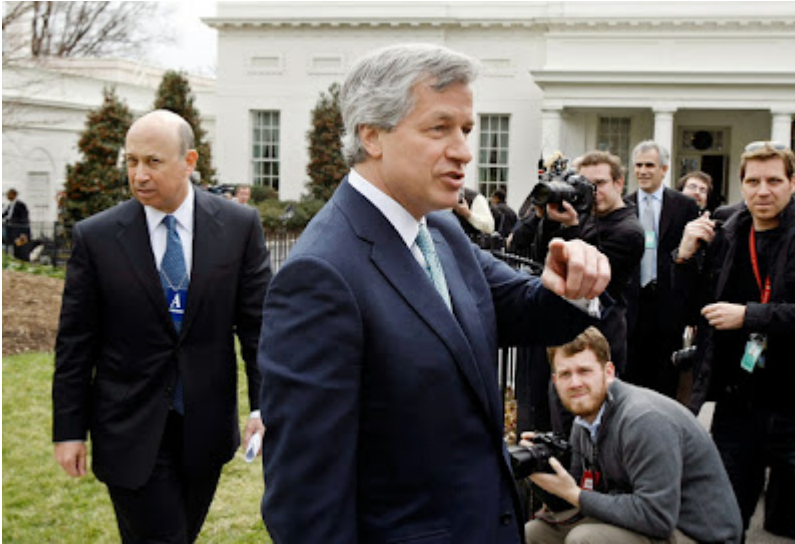
Photo: James 'Jamie' Dimon of JP Morgan, another banker who received a bailout from the Federal Reserve, is in fact also a Federal Reserve director . Indeed, the Federal Reserve is run by private bankers, for private bankers, who can bend American monetary policy to their will on a whim (with a little help from the lies of the corporate-media.)