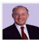
Jacob A. Frenkel Chairman and CEO, Group of Thirty; Chairman, JPMorgan Chase International; Former Governor, Bank of Israel