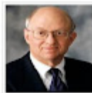
Martin Feldstein Professor of Economics, Harvard University; President Emeritus, National Bureau of Economic Research