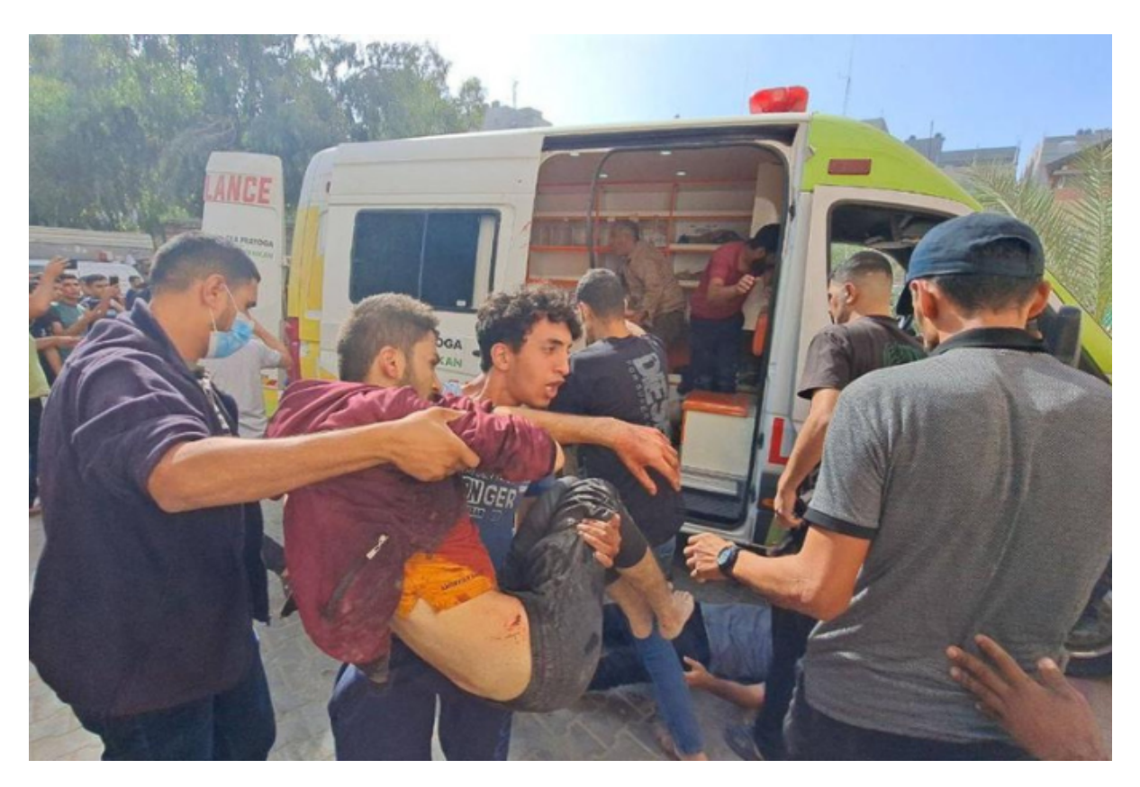
Gaza youth load victim into ambulances

Any comparison regarding the number of interviews, quotes, headlines and references between the Israeli government and those that either speak on behalf of the Palestinians or express sympathy and solidarity with their plight clearly reveal that the proponents and apologists for genocide have far greater access to the media. The representatives of the State of Israel coupled with their financial and military backers in Washington dominate the airwaves in a manner which seeks to convince the public that Tel Aviv is the victim in the current phase of this 75-year war which began with the forced removals of 750,000 Palestinians from their homeland in 1948.