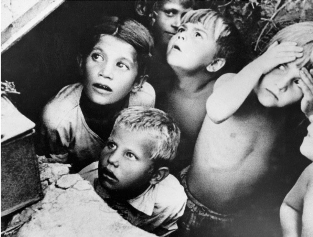
Soviet children during a German air raid in the first days of the war, June 1941

First of all Germany possessed a brilliant railway system, with 4 large rail lines running from east to west across the country, each of which was capable of taking 2 army corps from East Prussia to the Rhine, in western Germany, in 18 hours. It meant that the Germans could mobilise and transfer their forces much more quickly than other European states.