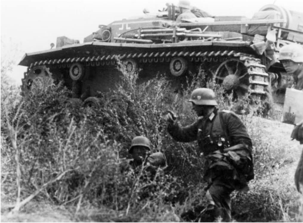
German infantry and a supporting StuG III assault gun during the advance towards Stalingrad, September 1942

Mawdsley discerned “at Kharkov the Wehrmacht again demonstrated the operational and tactical skills that had led to the victories of the summer and autumn of 1941” (7). The Soviet defeat at Kharkov saw a huge hole punctured in their defences. It was now possible for the German 6th Army to pour through this gap, allowing it a few weeks later to approach Stalingrad, located 385 miles further east of Kharkov as the crow flies.