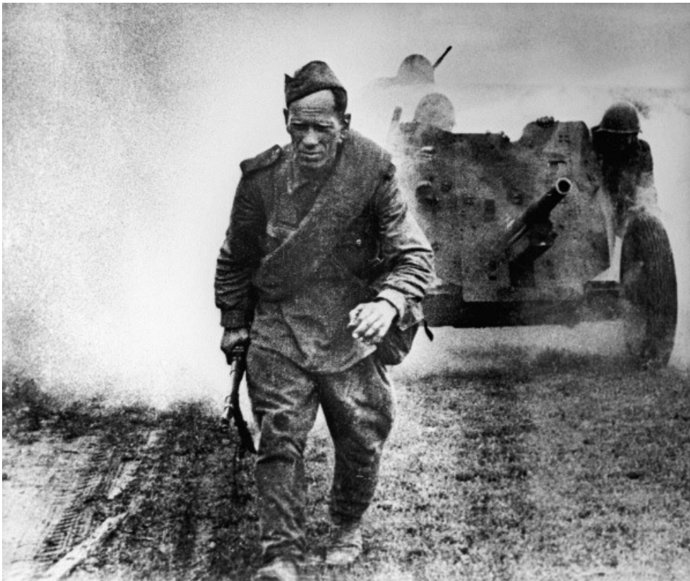
Soviet soldiers pushing a 45 mm (1.8 in) anti-tank gun on the road, 1 August 1943

Looking at the figures in the cold light of day, the fascist forces should have been at a disadvantage in the war from early on. Considering they were outnumbered in each department, the Germans should not have been able to conquer the amount of territory which they did, capture Kiev, Kharkov, encircle Leningrad and threaten Moscow, all of which unfolded in 1941. Further major gains were made by the Germans in the summer and autumn of 1942.