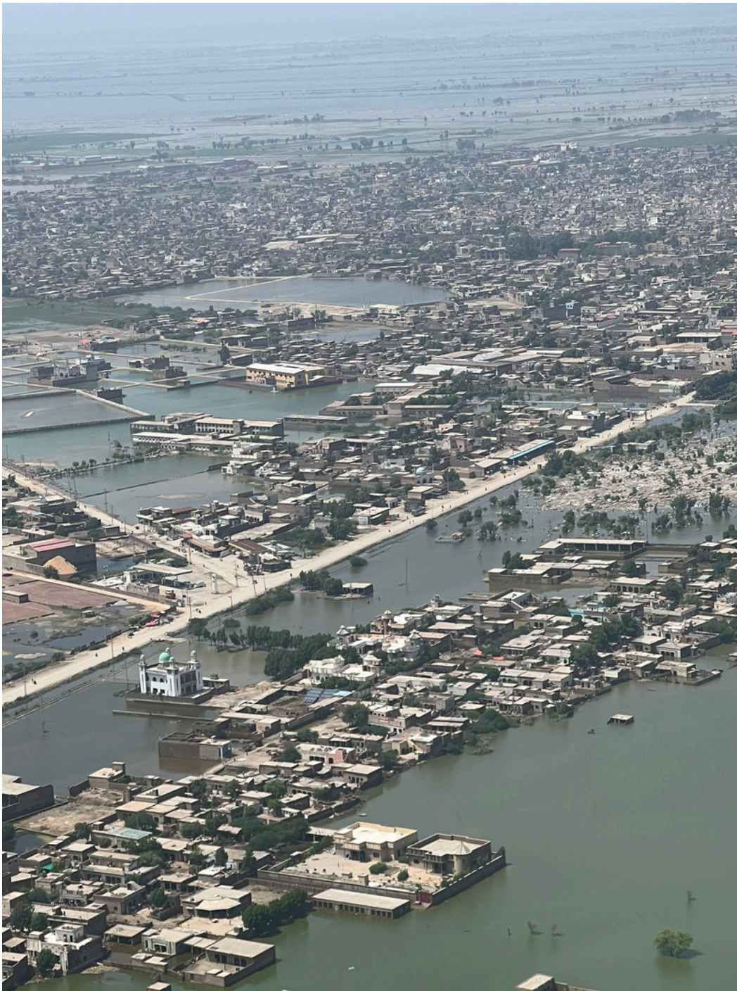
An arial view of Shahdadkot city covered with floods water in September 2022.

While, the fleet of helicopters of Army Aviation, the Pakistan Navy and Pakistan Air Force were deployed in flood-stricken areas. Their emergency response teams are also assisting civil administration in rescue and relief efforts of South Punjab, Balochistan and Sindh. Thus, these forces have also saved the life of thousands of individuals.