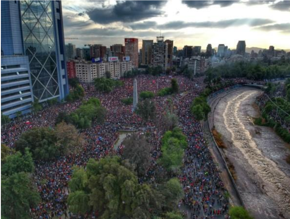
Protests in Plaza Baquedano, downtown Santiago