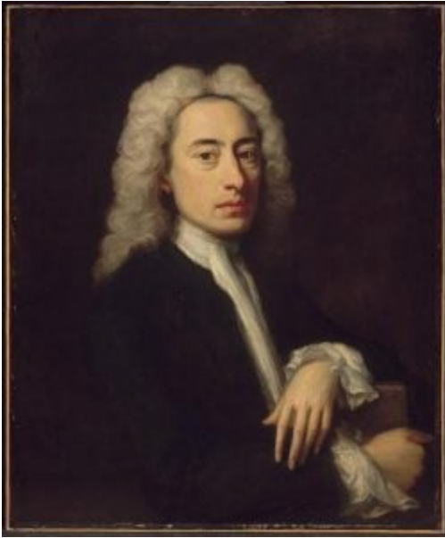
Image on the right: Alexander Pope, painting attributed to English painter Jonathan Richardson, c.1736, Museum of Fine Arts, Boston

The greatest patron of the arts throughout the Middle Ages was the Church. Patronage was also used by nobles, rulers, and very wealthy people to endorse their political ambitions, social positions, and prestige. Leonardo da Vinci and Michelangelo, William Shakespeare, and Ben Jonson all looked for and received the support of noble or ecclesiastical patrons.