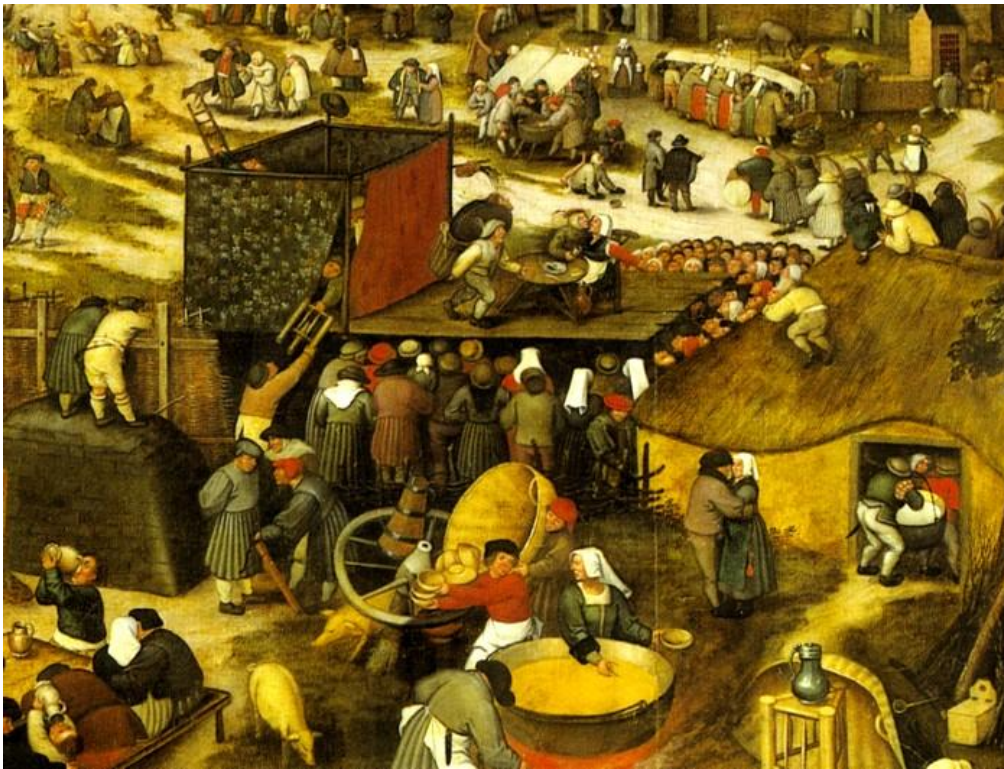
Village feast with theatre performance, artist from the circle of Pieter Bruegel the younger – central part of painting by unknown Flemish master