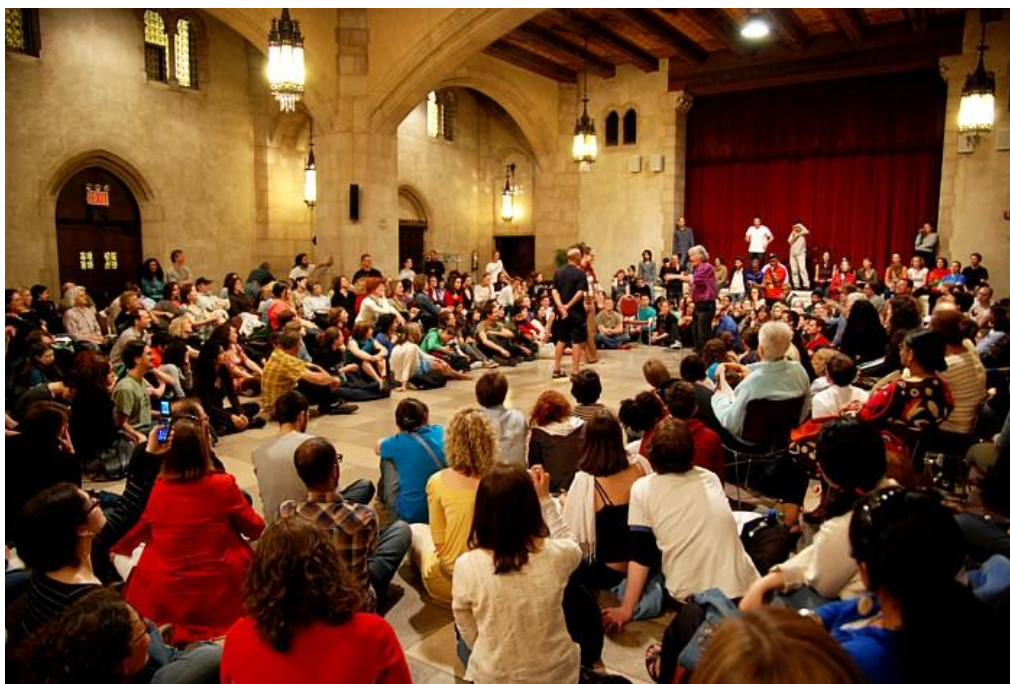
Augusto Boal presenting his workshop on the Theatre of the Oppressed . Riverside Church, May 13, 2008.

“The spectators feel that they can intervene in the action. The action ceases to be presented in a deterministic manner, as something inevitable, as Fate. Man is Man’s fate. Thus Man-the-spectator is the creator of Man-the-character. Everything is subject to criticism, to rectification. All can be changed, and at a moment’s notice: the actors must always be ready to accept, without protest, any proposed action; they must simply act it out, to give a live view of its consequences and drawbacks.” [1]