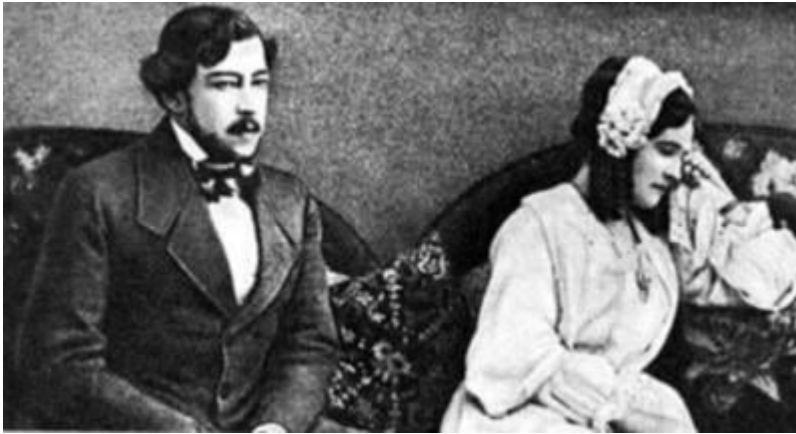
Stanislavski and Olga Knipper as Rakitin and Natalya in Ivan Turgenev's A Month in the Country (1909).

relationships and tendencies under the surface. The rest was discarded.”