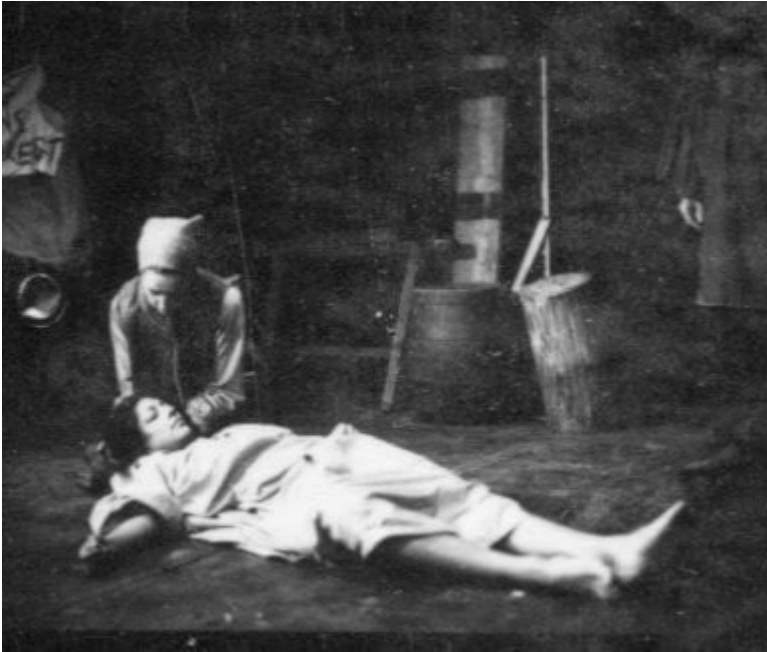
Photograph of Mother Courage and the dead Kattrin (Internationalist Theatre)

As the century wore on other types of political theatre emerged such as the differing forms of Documentary theatre of the 1960s and 1970s. This style of theatre “uses pre-existing documentary material (such as newspapers, government reports, interviews, journals, and correspondences) as source material for stories about real events and people, frequently without altering the text in performance. The genre typically includes or is referred to as verbatim theatre, investigative theatre, theatre of fact, theatre of witness, autobiographical theatre, and ethnodrama.”