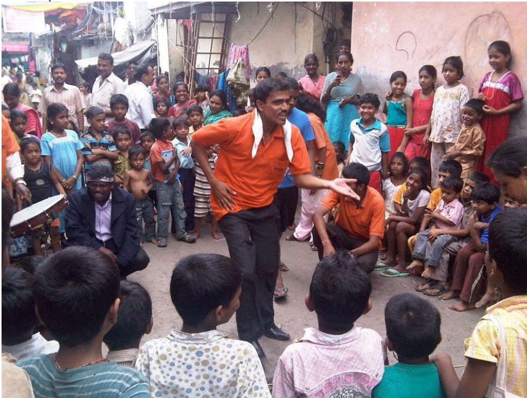
A street play (nukkad natak) in Dharavi slums in Mumbai.

"This matters, because the people traditionally holding the purse strings, controlling the presses; the people responsible for funding us and publishing us, are the same power elites who decide what constitutes a valid working-class voice, and an acceptable working-class identity. Arts Council England, for example, has nothing to gain from supporting people and projects who challenge or threaten their traditional business model, and most major publishers are wary of a working-class poetics that openly and explicitly acknowledges the politics of its own oppression. To have your work "out there" in any meaningful sense, to secure the invaluable financial assistance by which a creative project lives or dies, is to accept that your work, and that you, as a person, will be mediated, filtered and enmeshed, by and in the machinery of a grossly unequal hierarchy. By this method we are compromised. We tailor and shape our voices and ourselves to fit their image of us, and our working-classness is depoliticised and de-fanged through an act of caricature. By this mechanism is the triumph of working-class representation transformed into the tool by which working-class participation in the arts is edited, eroded and policed."