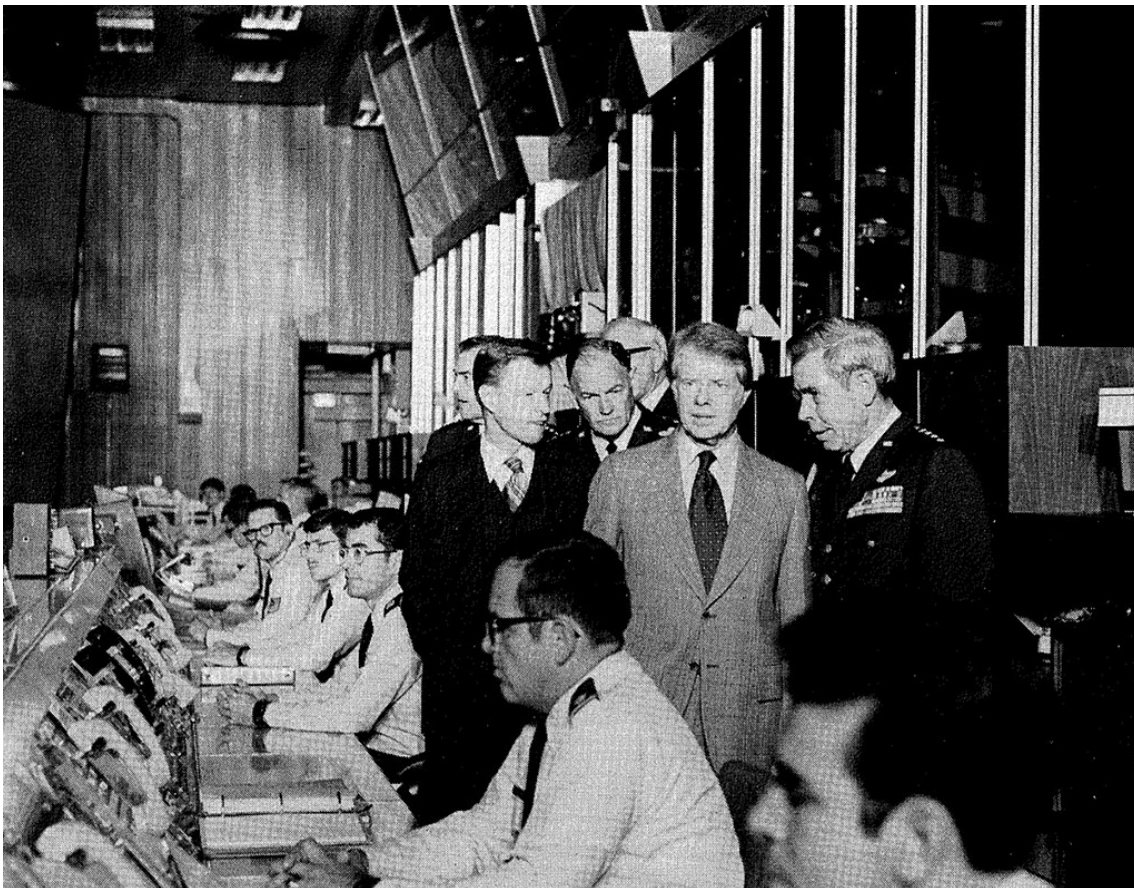
National Security Advisor Zbigniew Brzezinski accompanying President Jimmy Carter during a visit to Strategic Air Command's Headquarters in Offutt Air Force Base, Nebraska.