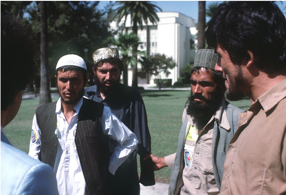
Afghan guerrillas that were chosen to receive medical treatment in the United States, Norton Air Force Base, California, 1986

To understand how Brzezinski's "fears" became self-fulfilling prophecies is to understand how his hard line against the Soviets in Afghanistan provoked the results he wanted and became adopted as American foreign policy in line with Team B's neoconservative objectives; "to destroy détente and to steer U.S. foreign policy back to a more militant stance viz-à-viz the Soviet Union." [17]