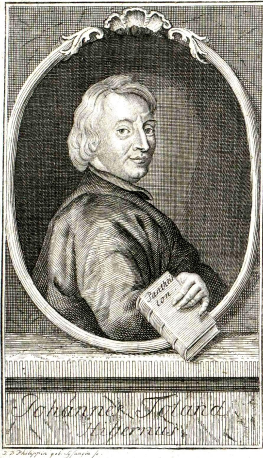
Image: The only known image of Toland

"He was an assertor of Liberty A lover of all sorts of Learning A speaker of Truth But no man's follower, or dependant"