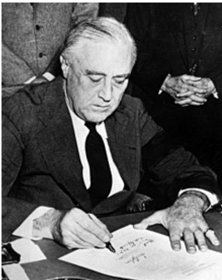
U.S. President Franklin D. Roosevelt signing declaration of war against Imperial Japan on December 8, 1941