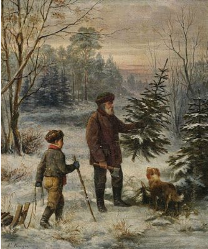
Father and son with their dog collecting a tree in the forest, painting by Franz Krüger (1797-1857)