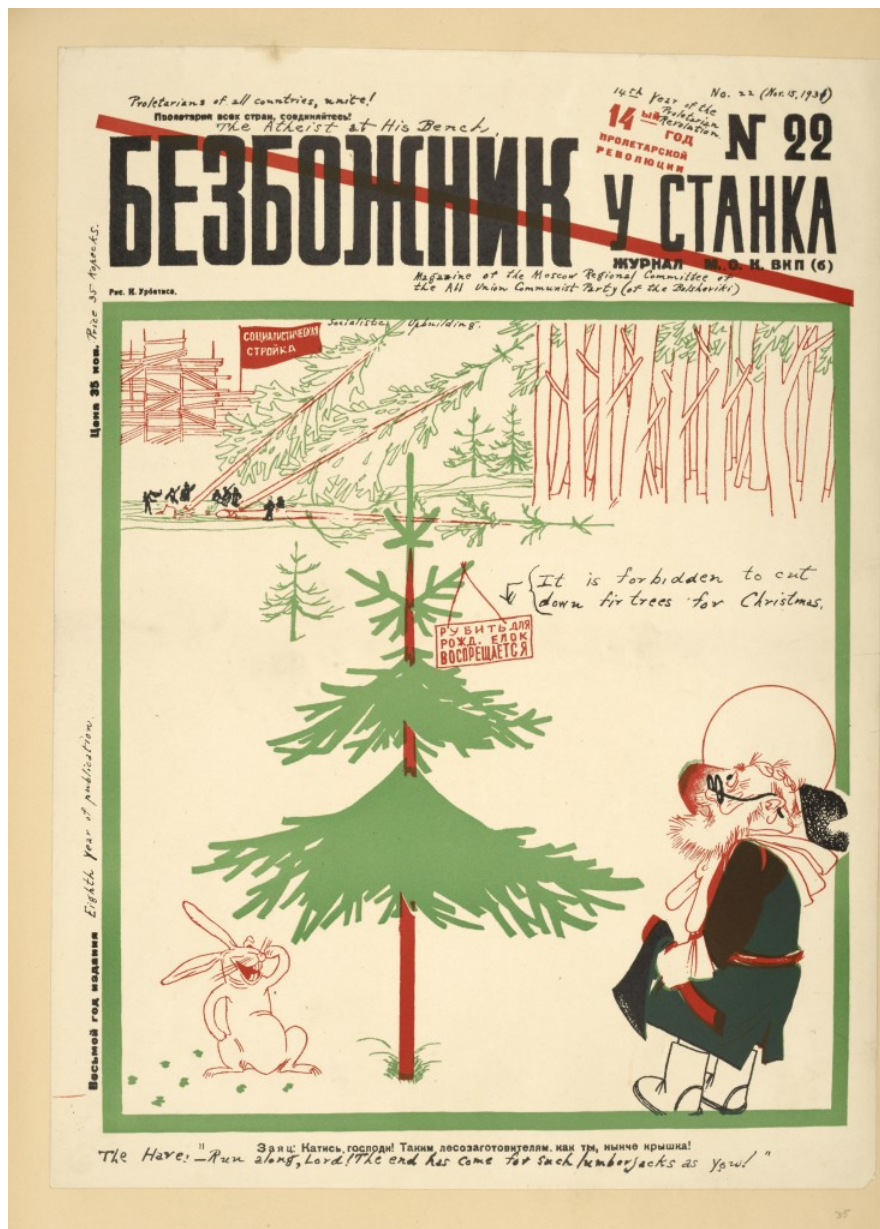
A 1931 edition of the Soviet magazine Bezbozhnik , distributed by the League of Militant Atheists, depicting an Orthodox Christian priest being forbidden to cut down a tree for Christmas