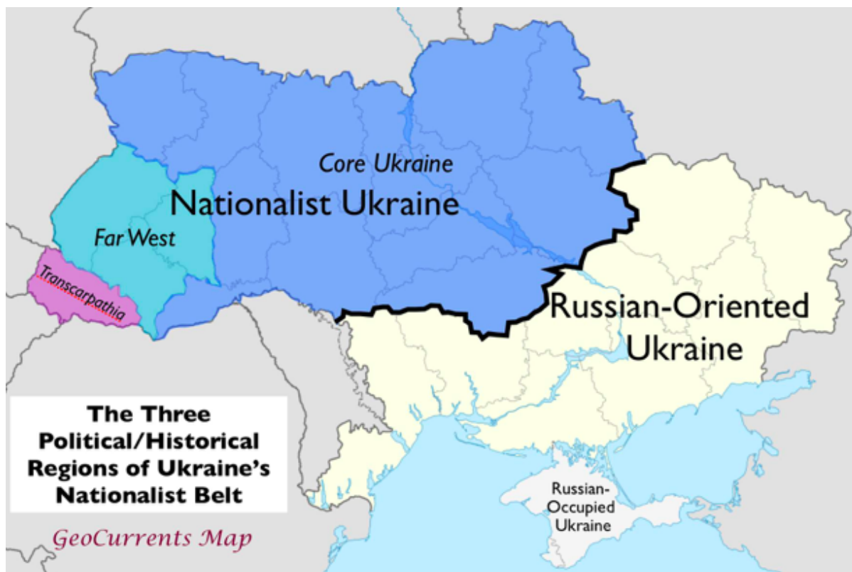
The regions of Ukraine according to the political orientation

The process of self-constructing identity of the Ukrainians after 1991 is basically oriented vis-à-vis Ukraine's two most powerful neighbors: Poland and Russia. In other words, the self-constructing Ukrainian identity (like the Montenegrin or Belarus) is able so far just to claim that the Ukrainians are not both the Poles or the Russians but what they really are is under great debate. Therefore, the existence of an independent state of Ukraine, nominally a national state of the Ukrainians , is of very doubt indeed from both perspectives: historical and ethnolinguistic.