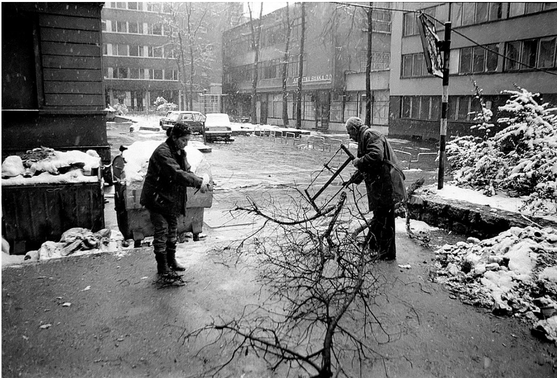
Cutting firewood in Sarajevo during wars that broke up Yugoslavia, 1993.

This process began in the 1990s, with the breakup of Yugoslavia.