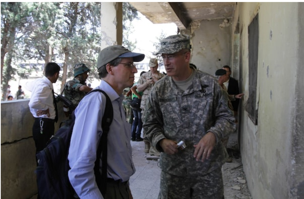
Ambassador Ford in Hama in July 2011

It is worth noting that Obama’s newly appointed CIA head, General David Petraeus played a key role the organization of covert support to rebel forces and “freedom fighters”, the infiltration of Syrian intelligence and armed forces, etc. Petraeus led the Multi-National Security Transition Command (MNSTC) “Counterinsurgency” program in Baghdad in 2004 in coordination with John Negroponte and Robert S Ford at the US Embassy in Baghdad.