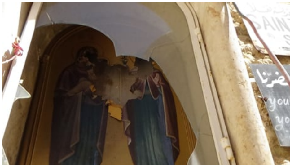
Terrorist-damaged religious iconography at Maaloula, Syria

The terrorists did invade this ancient and holy place, they did destroy religious icons, and they did kill many people.