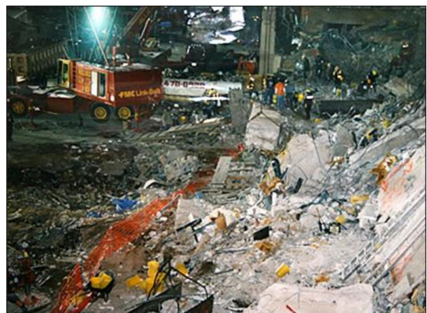
First World Trade Center bombing of 1993

Many have forgotten that there was a Phase One-Phase Two process with respect to 4/19 as well. Both immediately and thereafter there were a number of reports linking McVeigh and Nichols to Iraqis and other Middle Easterners, including Ramzi Yousef, the fugitive bomber in the 1993 World Trade Center bombing (which also used an ammonium nitrate (ANFO) bomb in a Ryder rental truck.) 29 Both Clinton and his Counterterrorism Coordinator, Richard Clarke, have confirmed that some of these stories were discussed at a meeting of the Counterterrorism Security Group on the day of 4/19. 30 Both men also claim to have dismissed them in favor of a low-grade Phase Two local conspiracy led by the two designated culprits: Timothy McVeigh and Terry Nichols. But reports of Middle Eastern involvement, sometimes attributed to sources inside government, continued to appear in the governing media, including CBS, NBC, and the New York Times . 31