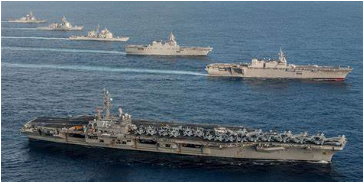
U.S. Pacific Fleet.

China condemned these arrogant displays of U.S. military power as reckless, provocative and meant to apply pressure.