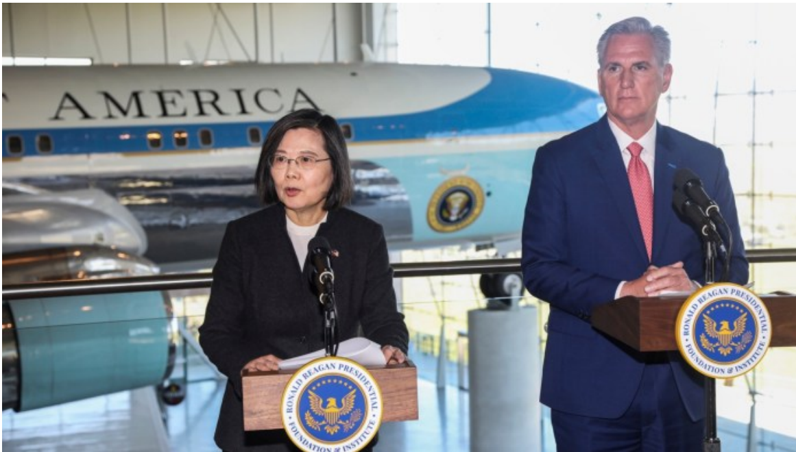
Tsai Ing-wen with House Speaker Kevin McCarthy (R-CA) during visit to the U.S. earlier this year.