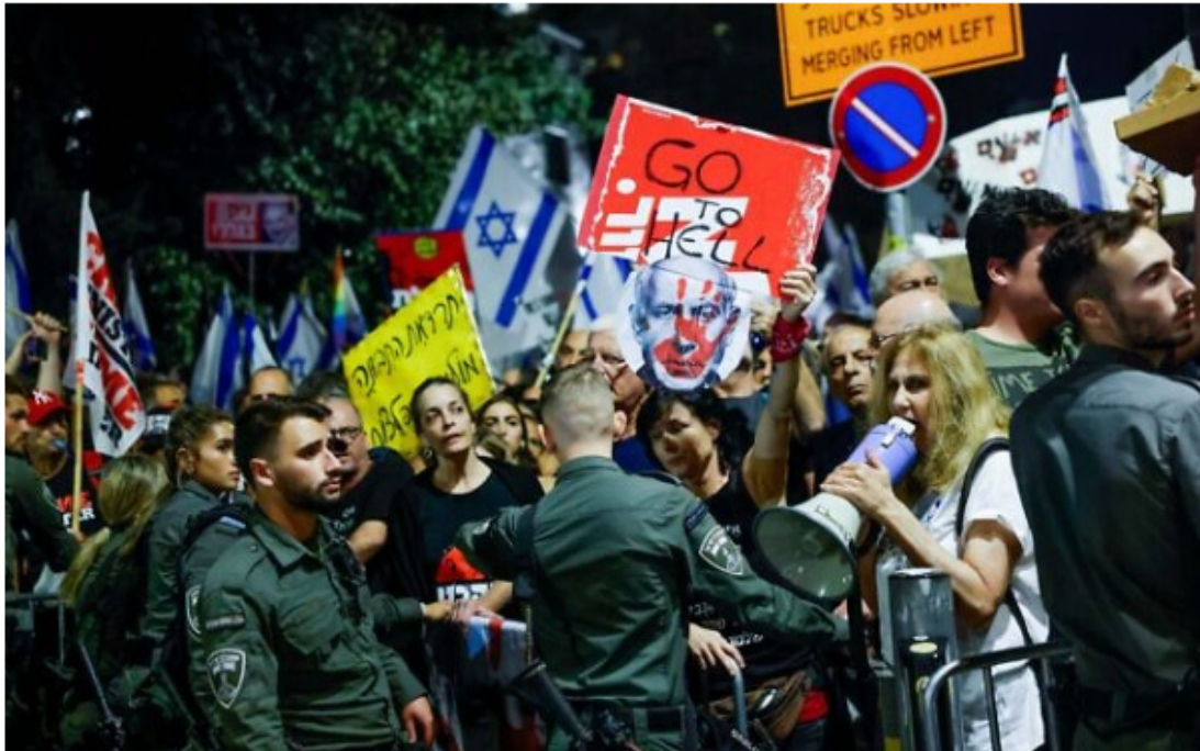
Protesters calling for the release of captives held by Hamas terrorists in Gaza rally outside Prime Minister Benjamin Netanyahu's home in Jerusalem, November 4, 2023.

The military operations have included an Israeli order to Gazans in the northern sector of the Gaza strip to move southwards. Many from this internally displaced population used the ceasefire to travel north in an effort to find their dead relatives in the rubble heaps and possibly to locate a few of their possessions that might have survived the bombing. IDF soldiers briefly broke the ceasefire by firing at northward-headed Palestinians. Two were killed and several were injured.