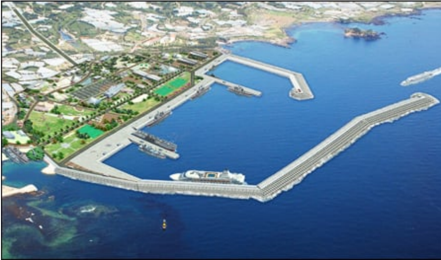
Jeju Existing Naval Base

However, Jeju Island is not only a precious natural treasure in Korea, it is also a UNESCO-designated World Heritage Site, which is slated to be transformed into a US island military base.