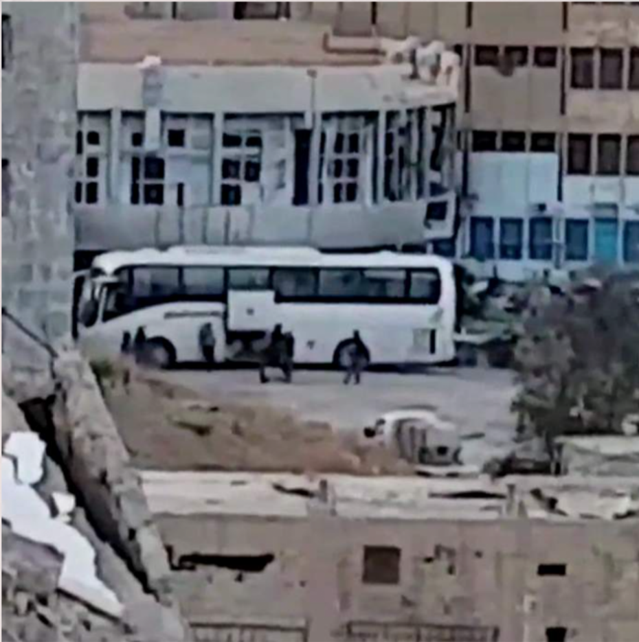
IS family members prepare to leave