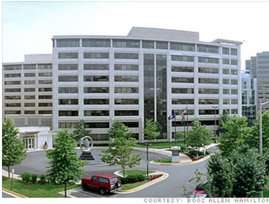
Booz Allen Hamilton Headquarters. Source .