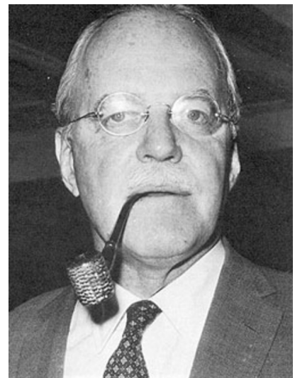
Miles Copeland, Jr., ex-CIA, ex-Booz Allen @ Hamilton, ex-Khashoggi’s private CIA.