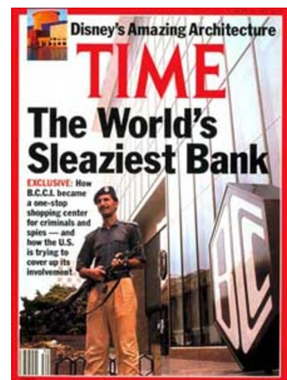
BCCI on the cover of Time, July 6, 1991.