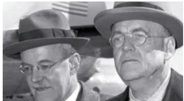
Allen and John Foster Dulles, pillars of both the state and the deep state.

But Truman declined, despite a direct personal appeal from Churchill, to have the CIA participate in efforts to overthrow Mossadeq, and instead dispatched Averell Harriman to Tehran in a failed effort to negotiate a peaceful resolution of Mossadeq's differences with London. 49