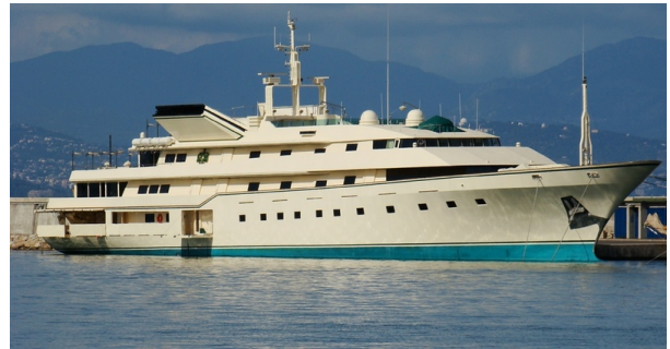
Khashoggi's Superyacht Kingdom 5KR, now owned by Prince Al-Waleed bin Talal. Source .