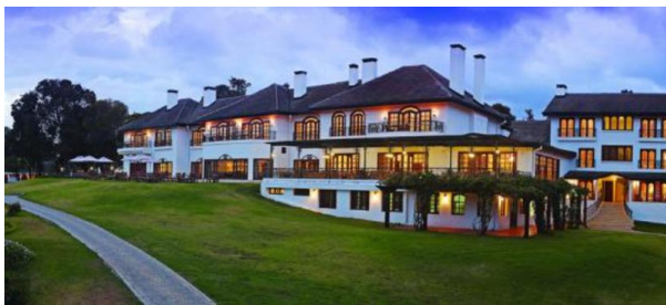
The Safari Club, now the Fairmont Mount Kenya Safari Club.