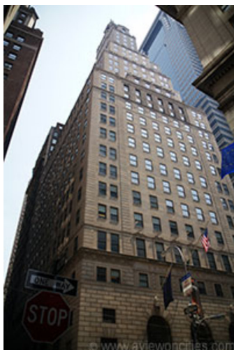
48 Wall Street, the former headquarters of both Sullivan and Cromwell and the J. Henry Schroder Banking Corporation. Source .

This mentality exhibited itself in 1952, when Truman’s Justice Department sought to break up the cartel agreements whereby Standard Oil of New Jersey (now Exxon) and four other oil majors controlled global oil distribution. (The other four were Standard Oil Company of New York, Standard Oil of California or Socony, Gulf Oil, and Texaco; together with Royal Dutch Shell and Anglo-Iranian, they comprised the so-called Seven Sisters of the cartel.) Faced with a government order to hand over relevant documents, Exxon’s lawyer Arthur Dean at Sullivan and Cromwell, where Foster was senior partner, refused: “If it were not for the question of national security, we would be perfectly willing to face either a criminal or a civil suit. But this is the kind of information the Kremlin would love to get its hands on.” 46