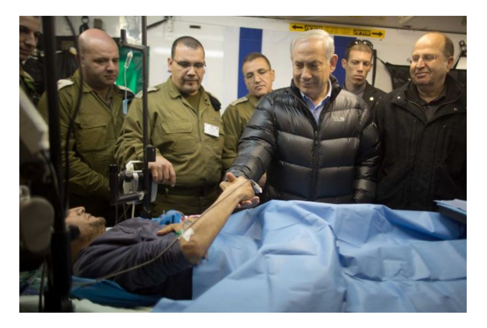
image. "Israeli Prime Minister Benjamin Netanyahu and Defence Minister Moshe Ya'alon next to a wounded mercenary, Israeli military field hospital at the occupied Golan Heights' border with Syria, 18 February 2014".

Jihadist fighters have met Israeli IDF officers as well as Prime Minister Netanyahu. The IDF top brass acknowledges that "global jihad elements inside Syria" [ISIL and Al Nusrah] are supported by State of Israel.