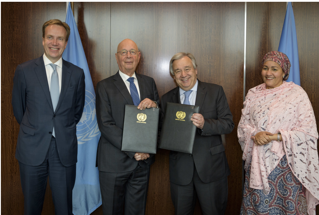
Signing of the WEF-UN Partnership

What this signifies is that the United Nations system has virtually been privatized.