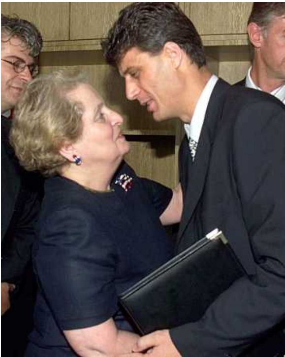
M. Albright and Hashim Thaci, 1998

21 Years later: 2 Decades of “Investigation”