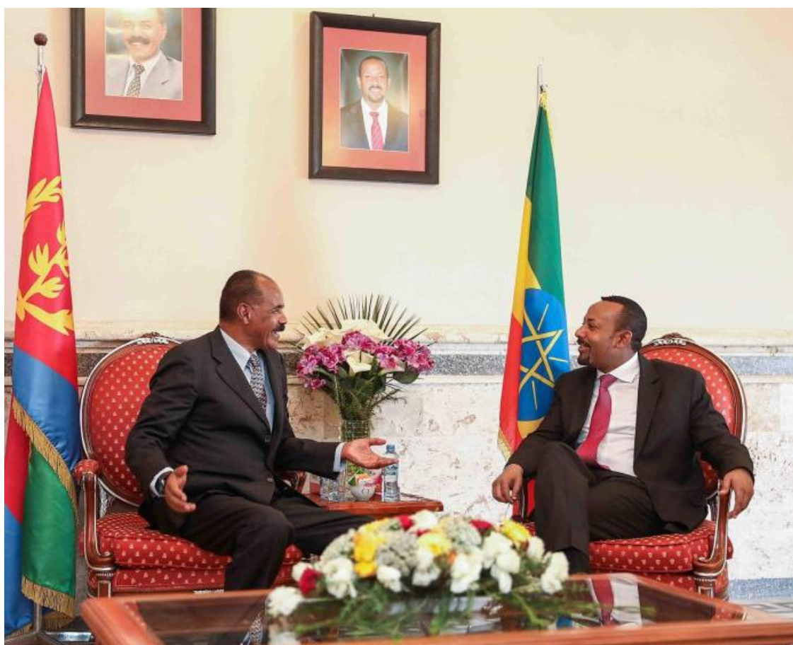
Abiy Ahmed with Eritrean President Isaias Afwerki in March 2019.