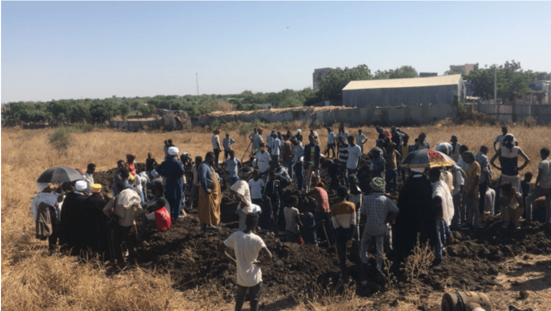
Funeral services at Abu Aregawi Church for victims of mass killing carried out by TPLF-allied militias that occurred in Mai Kadra on November 9, 2020.