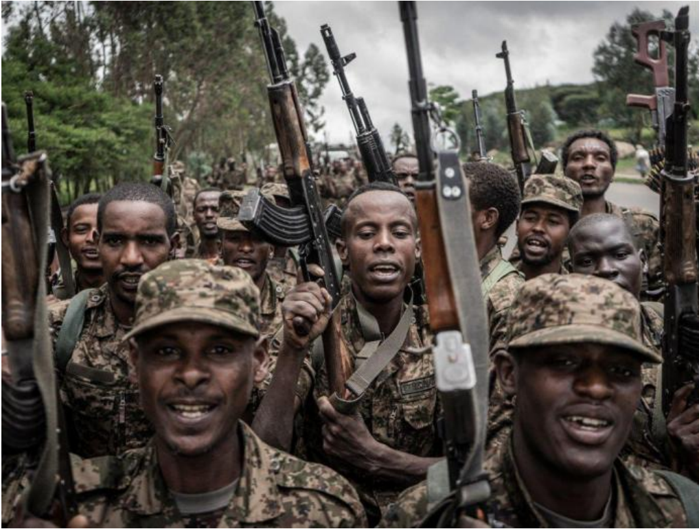
Tigray People's Liberation Front (TPLF) soldiers.