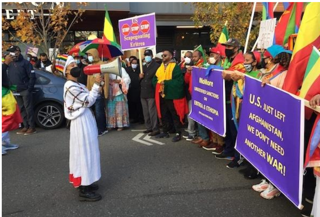
Ethiopia and Eritrea anti-sanctions demonstration in New York City.

After the TPLF tried to overthrow the Ethiopian government, Eritrea was accused of dressing its soldiers in Ethiopian army uniforms and committing atrocities against Tigrayans . [2]