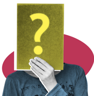
What is corruption?

Our global movement works in over 100 countries to end the injustice of corruption by promoting transparency, accountability and integrity.