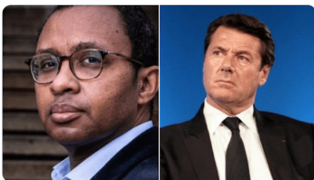
Image: Pap Ndiaye and Christian Estrosi

The alleged “facts”? Some children in 4th and 5th grades were said to have “performed the Muslim prayer in their school playground” or organized “a minute’s silence in memory of the Prophet Mahomet[1].” These were nothing more than rumors, as the expressions of doubt (“it is reported to me,” “or”) and the conditional tense (“These unacceptable situations would also have taken place in secondary schools”) clearly underlines. Worse still, before even the slightest verification of these absolutely insignificant alleged facts (it’s just a handful of 9-10 year-olds having fun in the playground), Christian Estrosi likened these “attempts at religious intrusion into the sanctuaries of the Republic that are our schools” to “religious obscurantism attempting to destabilize us” and to “families who left to wage jihad