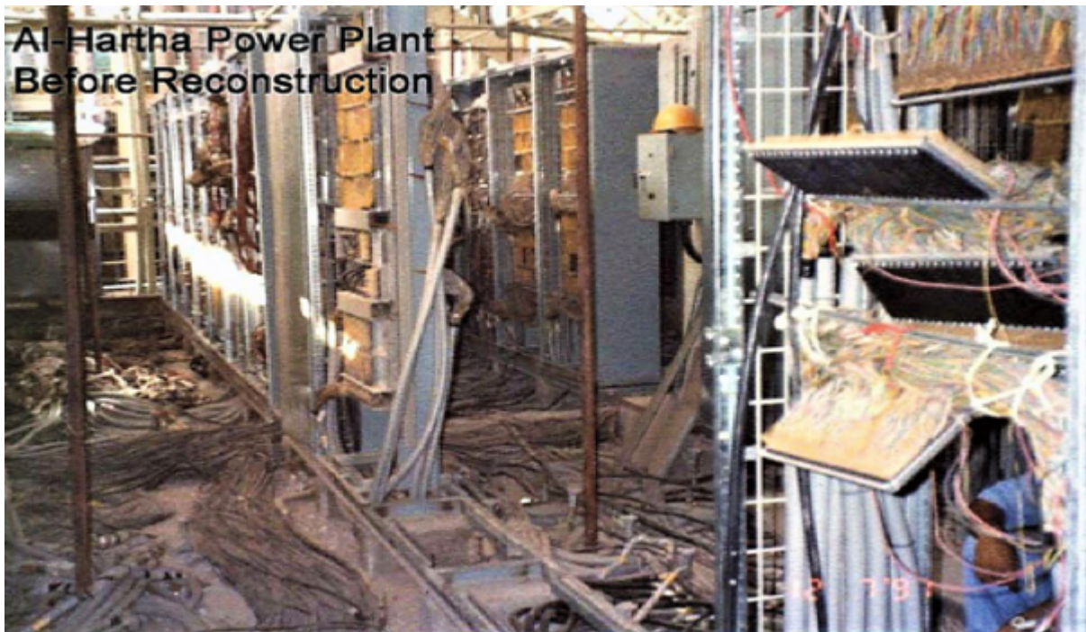
Destruction of Iraq’s population infrastructure by American Coalition in Gulf war II, 1991 [3]

“we have to emphasize here that the periling planning for the bombing campaign began before Iraq even invaded Kuwait last Aug.”] [4].