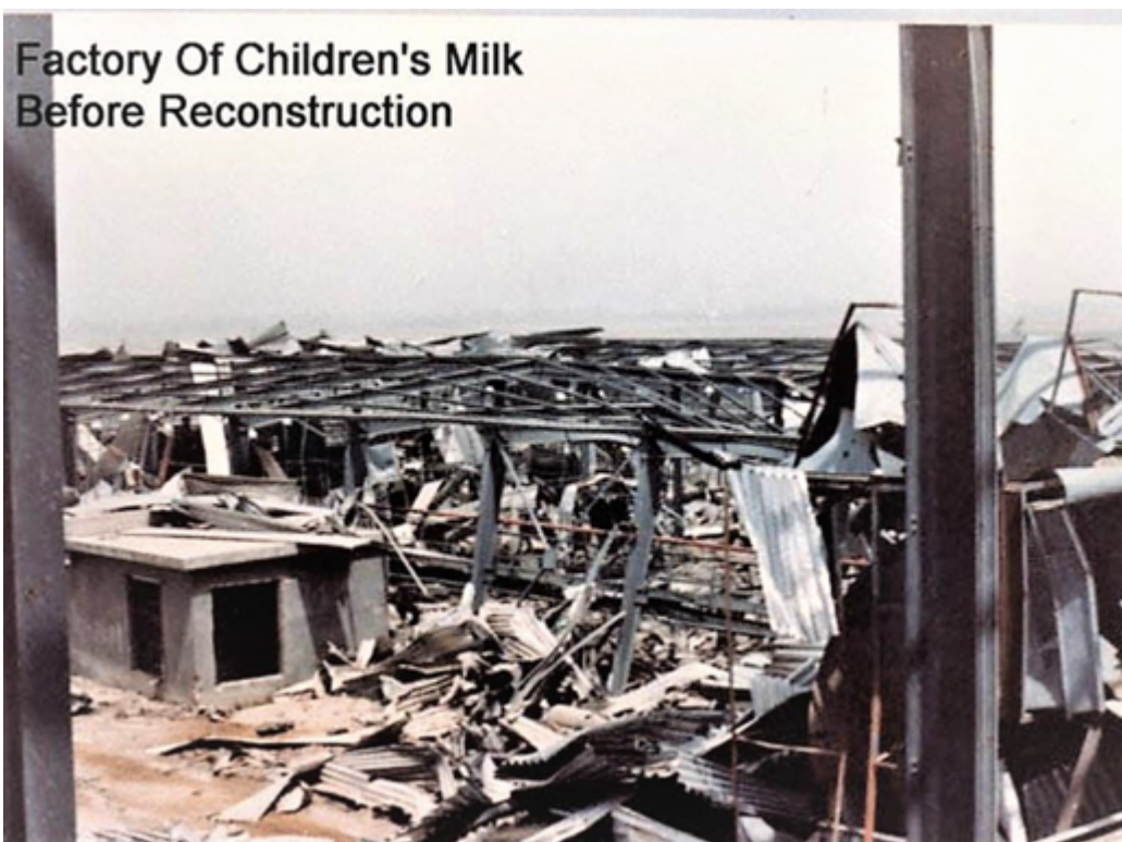
Destruction of Iraq's population infrastructure by American Coalition in Gulf war II, 1991 [3]