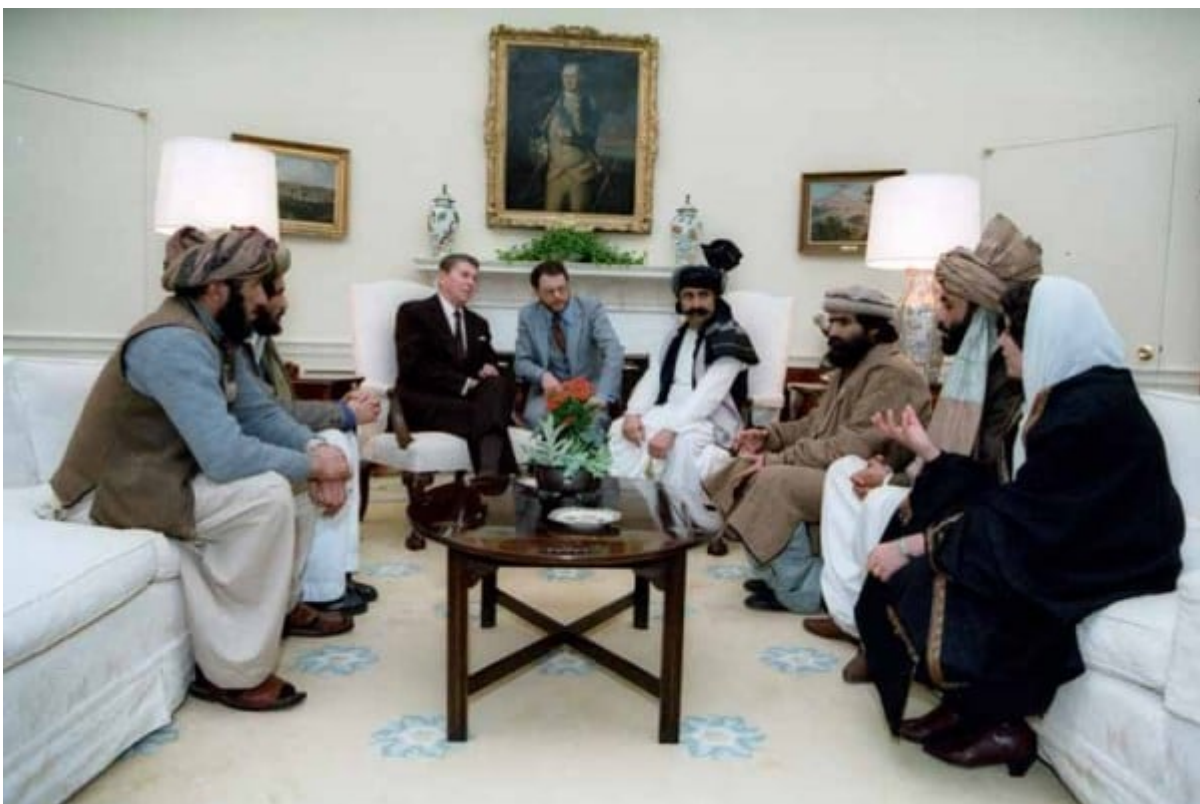
President Reagan and Mujahideen leaders from Afghanistan

Ronald Reagan called the terrorists “freedom fighters”. The US supplied weapons to the Islamic brigades. It was all for “a good cause”: fighting the Soviet Union and regime change, leading to the demise of a secular government in Afghanistan.