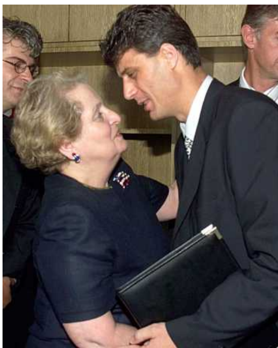
Thaci and Albright, Rambouillet, December 1998

The leader of the KLA, Hashim Thaci, “The Snake”, who subsequently became Prime Minister was a protégé of Madeleine Albright.