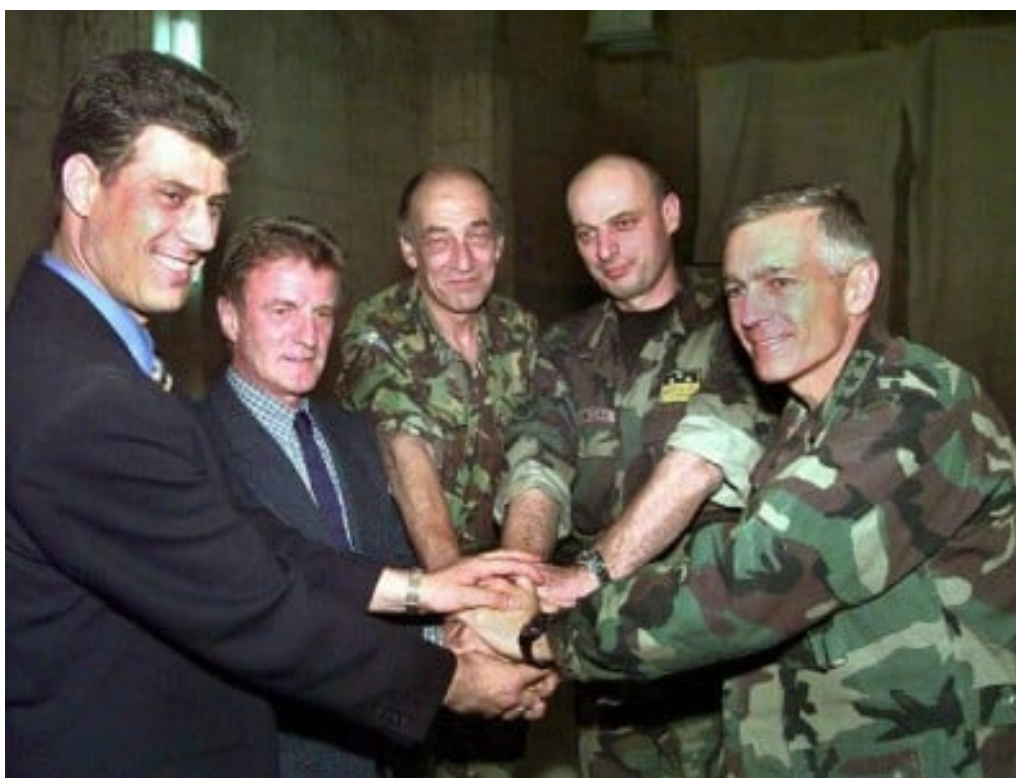
From Left to Right: Hashim Thaci, Bernard Kouchner, Lt. Gen. Michael Jackson, Agim Ceku, Gen Wesley Clark

Visibly what was shaping up in the wake of the bombings in Kosovo was the continuity of NATO’s operation in the Balkans as well as its reliance on war criminals in its “peace-keeping” undertakings. Military personnel and UN bureaucrats previously stationed in Croatia and Bosnia had been routinely reassigned to Kosovo.