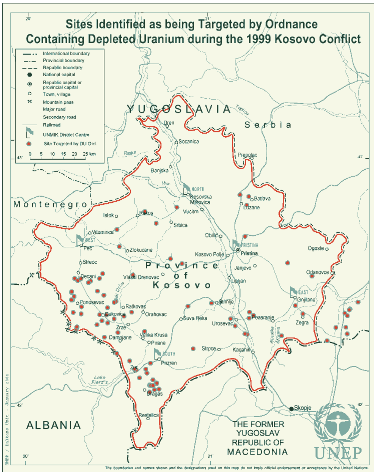
Map of Contaminated Areas “Map Of Sites As Being Targeted By Ordnance Containing Depleted Uranium during the 1999 Kosovo Conflict”