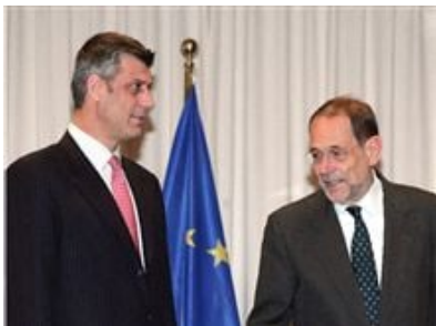
Hashim Thaci and former EU Secretary-General Javier Solana

Hashim Thaci became president of Kosovo in 2016.