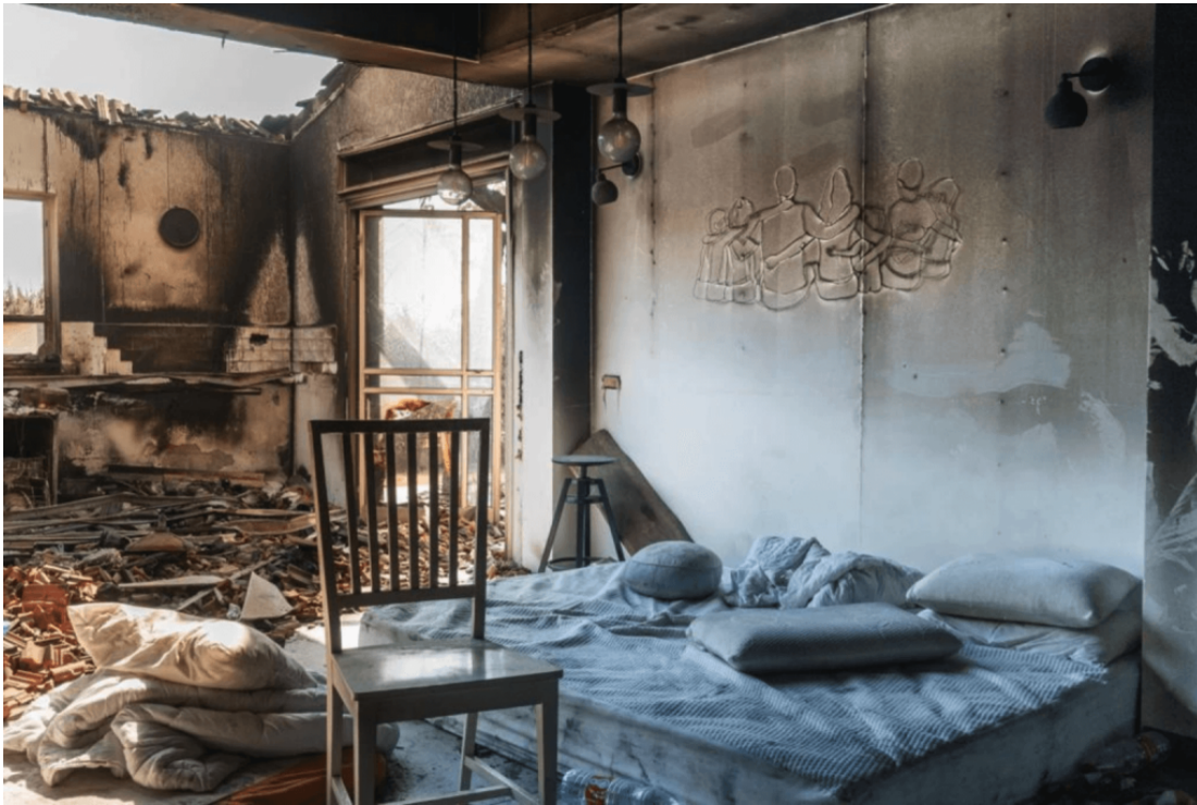
Photo released by the Israeli military from the events of October 7, 2023

Developments since October 7 has once again brought to the fore the centrality of the Palestinian question in the modern era. Even though the propaganda and psychological warfare aimed at defending the Zionist government reached new levels of depravity in the aftermath of the Al-Aqsa Flood, Palestine solidarity has grown by leaps and bounds.