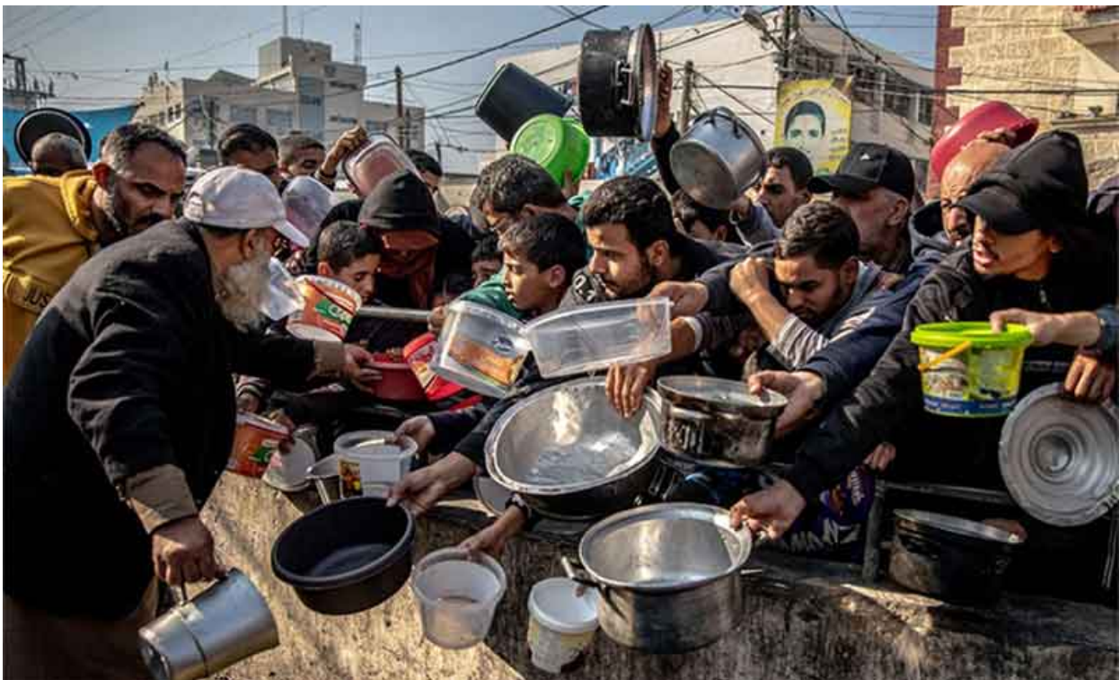
Famine in Gaza, 2023-2024

History is replete with the latter type, where the fear of not being immortal leads to the extermination of others, as if to say: “See, we are number one.” You die but we live. This is the case with the present Israeli policy of genocide of the Palestinians through famine, bombs, and guns.