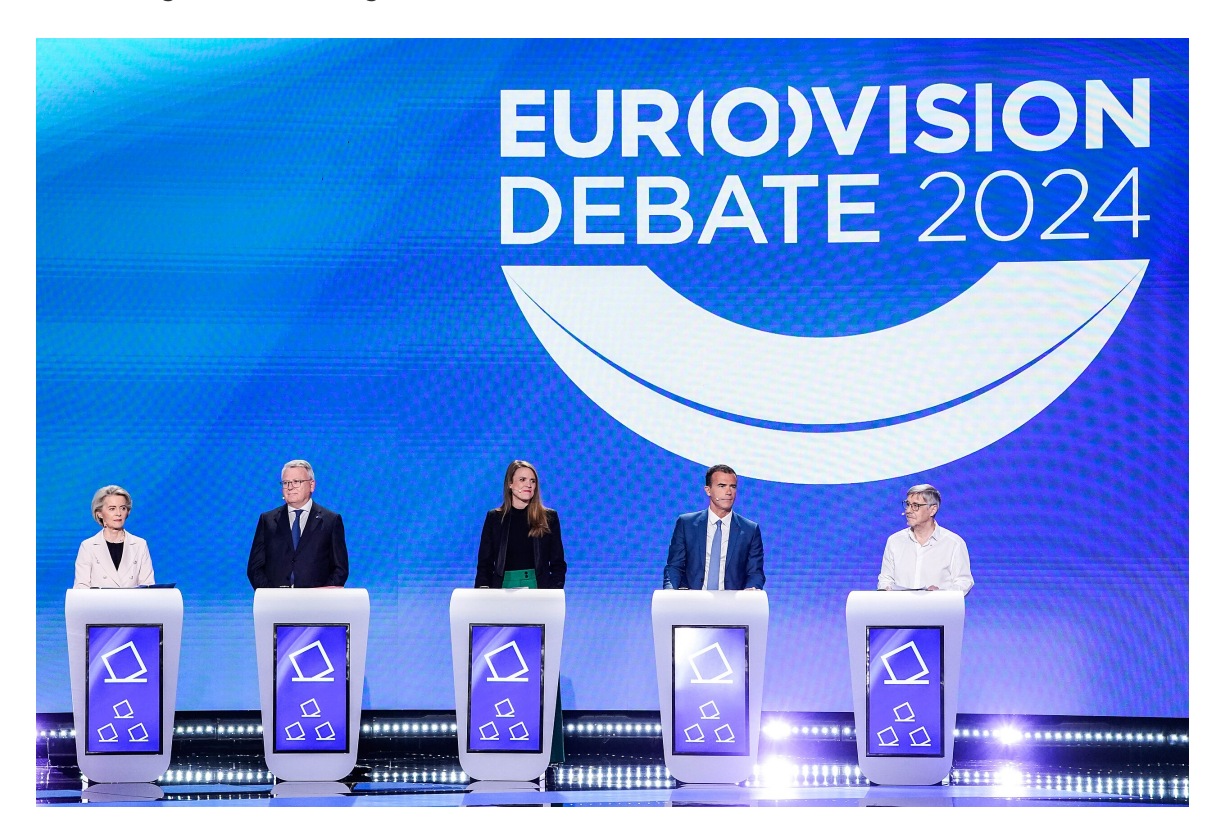
Eurovision Debate 2024 with Lead Candidates

For example, this past weekend (8 / 9 June 2024), an Anti-Globalist rage swept Europe . Elections took place in many countries in Europe, notable for the European Parliament – where the so-called left, the corrupted "socialists" (no longer deserving their noble name) and greens, the Master Globalists (as in the Green Deal , the largest sham in recent party history) were out-voted by a landslide, in favor of conservative politicians and parties representing the will of the people, national sovereignty, personal independence – screaming a loud NO to globalism.