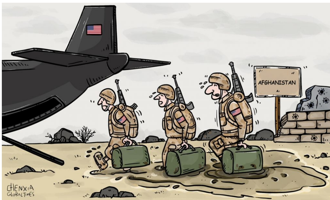
Afghanistan withdrawal by the Pentagon portrayed in Global Times

Clearly then, Bin Laden and his cohorts had reasons to be angry, though this does not for a moment condone their terrorist activities which often deliberately targeted civilians. In November 2002 Bin Laden predicted the US would suffer a “military defeat” in Afghanistan and that they would be forced to withdraw from the country, which is what unfolded 10 years after Bin Laden’s death.