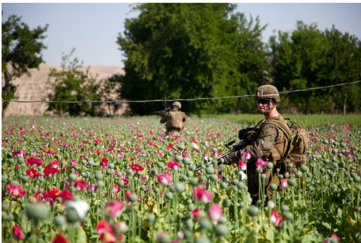
U.S. troops guarding an opium poppy field in Afghanistan.

The terrorist attacks of 11 September 2001 (9/11) against America enabled the White House to increase the expansionist goals of the country’s foreign policy. Zbigniew Brzezinski, the former US National Security Advisor, wrote that Japan’s bombing of Pearl Harbor had united the American public behind the nation’s entry into the Second World War; just as the 9/11 atrocities led to significant support in America for military action abroad.