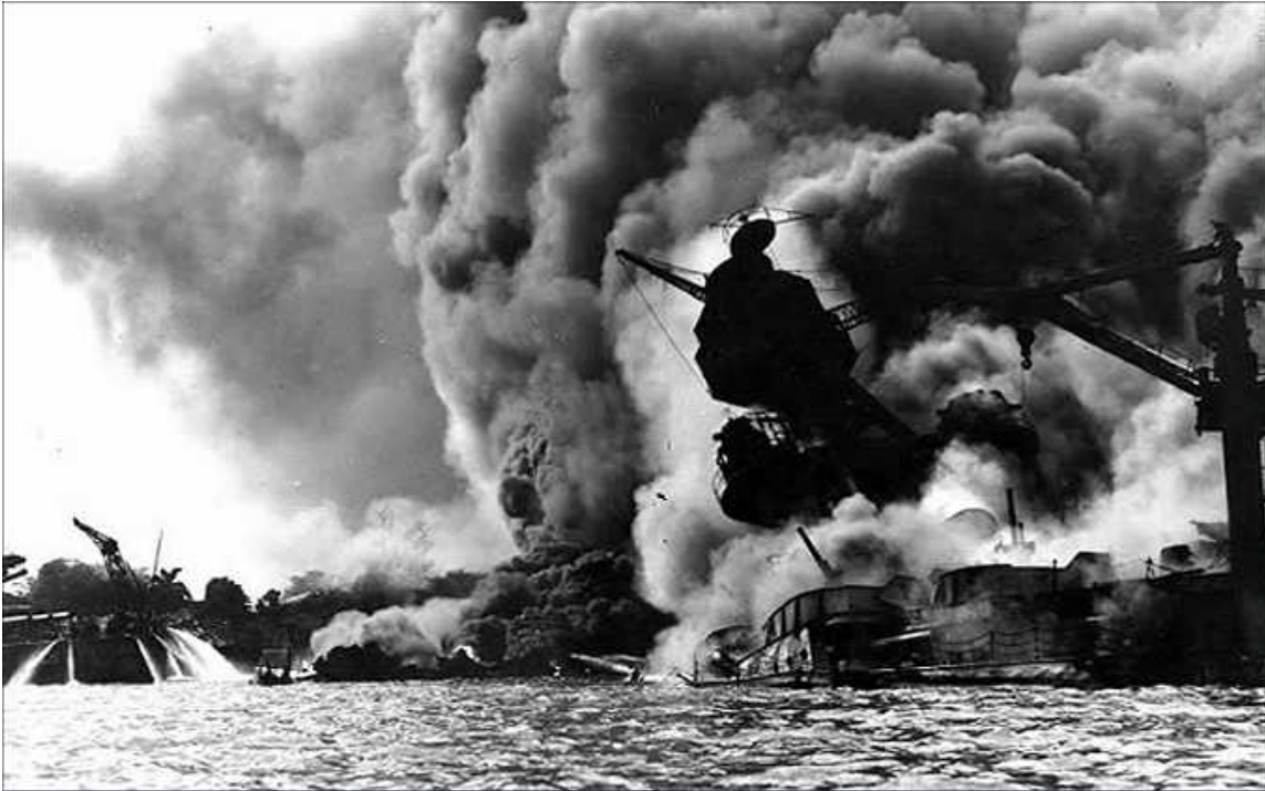
Following a direct hit from Japanese war planes, the USS Arizona burns and sinks in Pearl Harbor.

Just over four months before, on 26 July 1941 Roosevelt's government, in response to the Japanese Army invading southern French Indochina, enacted a series of crippling economic sanctions on Japan which included freezing all Japanese assets in America. Britain and the Dutch government-in-exile followed suit. The Western sanctions immediately resulted in 90% of Japan's oil imports being wiped out along with 75% of the country's foreign trade.