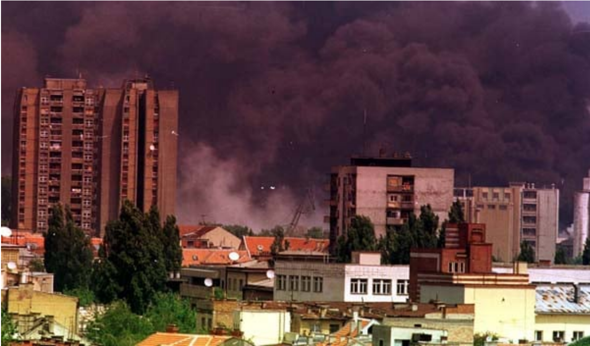
The Yugoslav city of Novi Sad on fire in 1999

In the 18 months before Milosevic's presidency ended in October 2000, the US and the EU spent about $80 million on such areas as the opposition media in Serbia. Western funding stretched further back, to the mid-1990s, when large sums of US and EU money started to enter Serbia. Washington pursued this policy mostly through USAID and the National Endowment for Democracy (NED), which are closely linked to the White House.