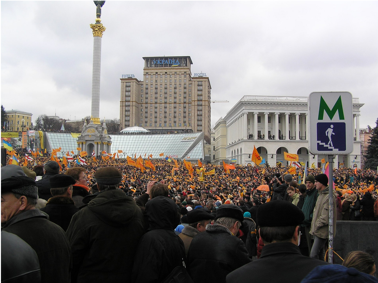
Orange-clad demonstrators gather in the Independence Square in Kyiv on 22 November 2004.