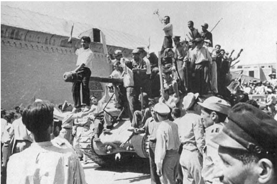
Tanks in the streets of Tehran, 1953. Coup supporters celebrate victory in Tehran (Licensed under the Public Domain)

The CIA and MI6 funded anti-government demonstrations in Tehran, with the goals of forcing Mosaddegh from power and bringing Iran back under Western domination. More recently, Soros has regularly made use of “activists” by placing them on his payroll and they then stoke unrest in a particular nation designated for regime change.